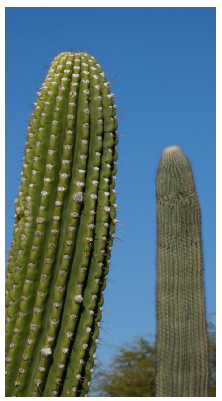
Figure 9. A stem of the Argentine saguaro ( Echinopsis terscheckii ) in the foreground, with a saguaro stem in the background.

The Argentine saguaro, Echinopsis terscheckii (synonym Trichocereus terscheckii ) bears a close resemblance to the saguaro of the Sonoran Desert. The Argentine plant has a thinner maximum girth of stems and branches, a different branching and flowering pattern, different fruits, and a paler yellow-green color to its stems (Figure 9). It has been claimed to be more cold-tolerant than saguaro. Generally, saguaro is the hardiest of the large columnar cacti, and it is this hardiness which has allowed it to expand its range farther north than any other large columnar cactus. Cacti from South America's Andes Mountains may experience colder temperature extremes, but their proximity to the Equator ensures a regular daytime warmup. Their cold is deeper but shorter in duration.