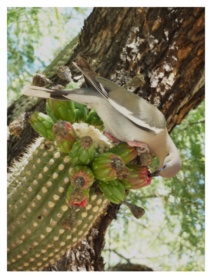
Figure 3. White-winged dove (Zenaida asiatica) feeding on saguaro fruit pulp.