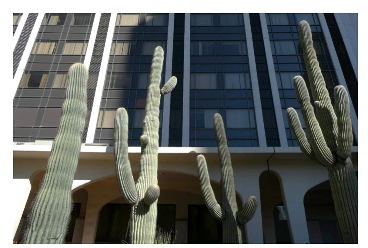
Figure 1. Saguaro in an urban landscape in downtown Tucson, Arizona.

There are a number of good reasons to select a saguaro for your landscape if you live in southern Arizona within the natural range of the plant. In this region of the Sonoran Desert the saguaro is a native plant that is easy to grow. When