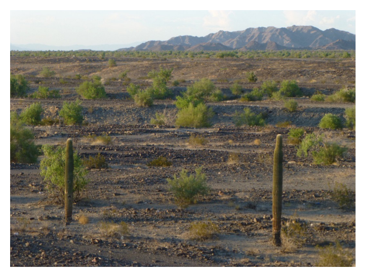
Figure 6. Desert environment near Ehrenberg, in southwest Arizona. Saguaro are infrequent, because saguaro seedling recruitment is low.