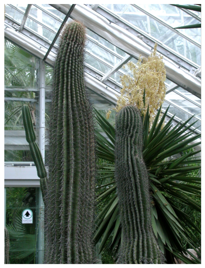
Figure 8. Saguaro cultivated in the Conservatory of the United States Botanic Garden in Washington D.C. Stems are narrow and shrunken as compared to healthy plants.

Saguaro perform poorly long-term under greenhouse cultivation in northerly latitudes (Figure 8). Mature saguaro only grow during the hot weather of the Sonoran Desert summer and fall (Yetman et al. 2020). Conservatories may not effectively duplicate this temperature regime. It is also possible that conservatories desiring an iconic saguaro are prone to shipping in large specimens with arms, which are vulnerable to damage in shipment and are poor prospects for establishment. Remarkably better success in greenhouse cultivation may be achieved with columnar cacti of subtropical origin from genera such as Cereus, Myrtillocactus, Pilosocereus and Stenocereus . Many species in these genera prove adaptable to greenhouse cultivation in northerly latitudes.