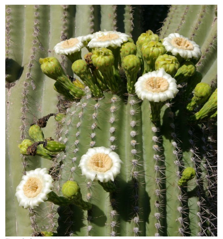
Figure 2. Saguaro in bloom.

a properly chosen saguaro is planted correctly it can be easy to establish, and after establishment it can require little to no care or watering. The saguaro is emblematic of our region and it is rarely grown to maturity in good health outside our region. A dramatic plant, a saguaro makes a great focal point or accent in a xeriscape or cactus garden. Saguaro can be grown in Phoenix, Tucson, Yuma and nearby desert areas without worries of cold damage which may harm other tall cacti. Saguaro have a small footprint in a landscape. A modest-sized vard can potentially hold several saguaro. The saguaro is perhaps the cleanest tree you can include in a landscape, dropping only spent flowers and fruits for a short span of the year. The saguaro provides flowers in early summer (Figure 2) which attract wildlife, particularly bats and white-winged doves (Yetman et al. 2020). The flowers are followed by fruits which are delicious and will attract more wildlife (Banks 2008) (Figure 3).