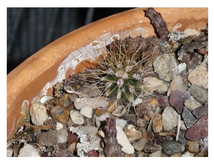
Figure 5. Saguaro seedlings are often encountered as "weeds" germinating with containergrown cacti and succulents grown outdoors in southern Arizona.

No region in Arizona is too warm and dry for saguaro. The western border of Arizona is the hottest and driest part of the state. Rainfall in the Yuma area can be less than 3 inches per year (Banks 2008). Saguaro are infrequent in this area, and are less likely to produce arms (Banks 2008) (Figure 6). Very low recruitment of seedlings results in few adult saguaro. But planted saguaro can prosper in southwestern Arizona.