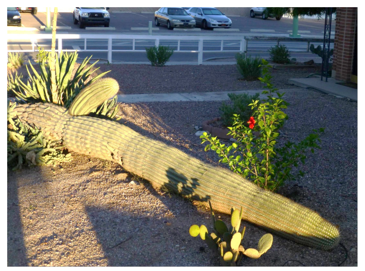
Figure 4. A fallen saguaro in an urban landscape.