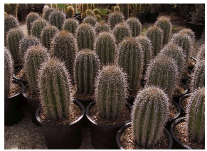
Figure 3. Saguaro growing in number 5 (five-gallon) containers, an ideal size to purchase, transport and plant in the ground without special skills or tools.