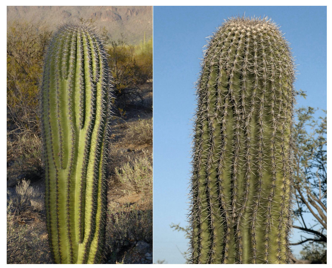
Figure 10. A hydrated saguaro (left) compared with a dehydrated saguaro (right) with visibly shrunken ribs during a period of drought.