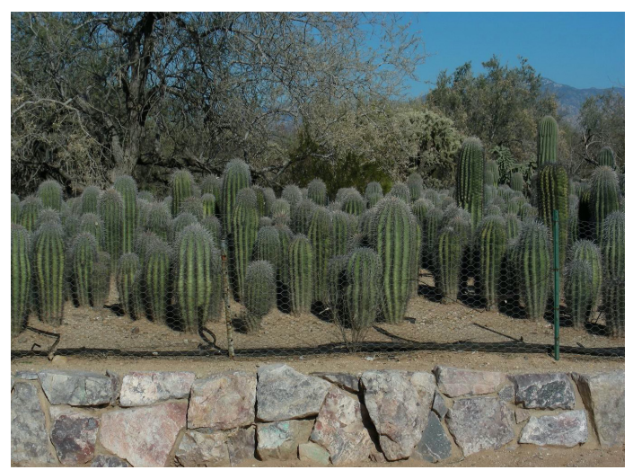
Figure 4. Saguaro grown in a nursery bed, mostly the same size class as in Figure 3.

Saguaro in the 3-4 foot range are less available as container grown plants but may be available in tree boxes (Figure 5). More often saguaro of this size are bare-root plants sourced from in-ground nursery beds, dug from the desert, or moved during construction. Plants in this size class are reaching the size and weight limit of easy handling, and typically must be lain horizontal for transport. Saguaro over four feet tall are subject to additional regulation concerning relocation (Native Plants, Arizona Department of Agriculture 2020).