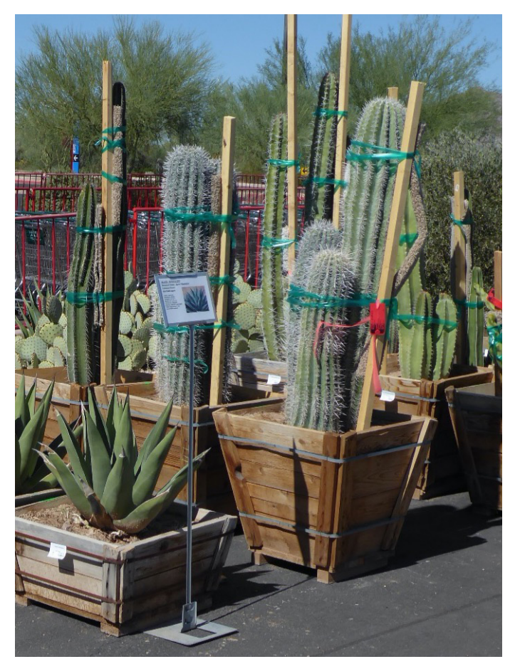
Figure 5. Mid-sized saguaro offered for sale in tree boxes.

Saguaro over 5 feet in height often display a proportional increase in girth which makes this size class notably bulkier and heavier than shorter saguaro. A 5 to 6 foot tall saguaro may weigh 300-600 pounds depending on its girth (Arizona Game and Fish Department 2019). These saguaro can require several handlers and dedicated moving tools, such as a heavyduty stretcher or cradle padded with carpet.