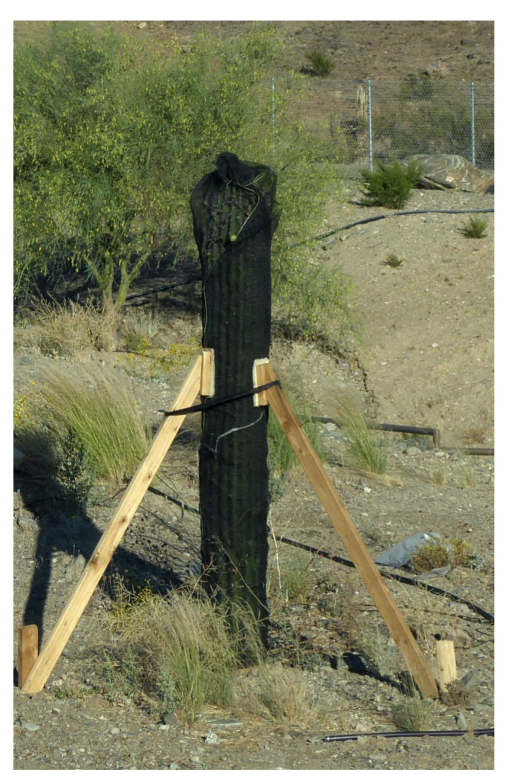
Figure 9. A trio of wooden braces support a young adult transplanted saguaro. The plant has been wrapped in shade cloth prior to installation of braces. A temporary irrigation system provides water for establishment.

sun is detrimental, as saguaro may sunburn after removal of the cloth. Shade cloth should be wrapped around the plant, with the seam on the north side (Arizona Game and Fish Department 2019). The cloth may be held by the cactus spines, but should be additionally tied to the stem to prevent it blowing away. The cloth should be left on through the first summer (Arizona Game and Fish Department 2019).