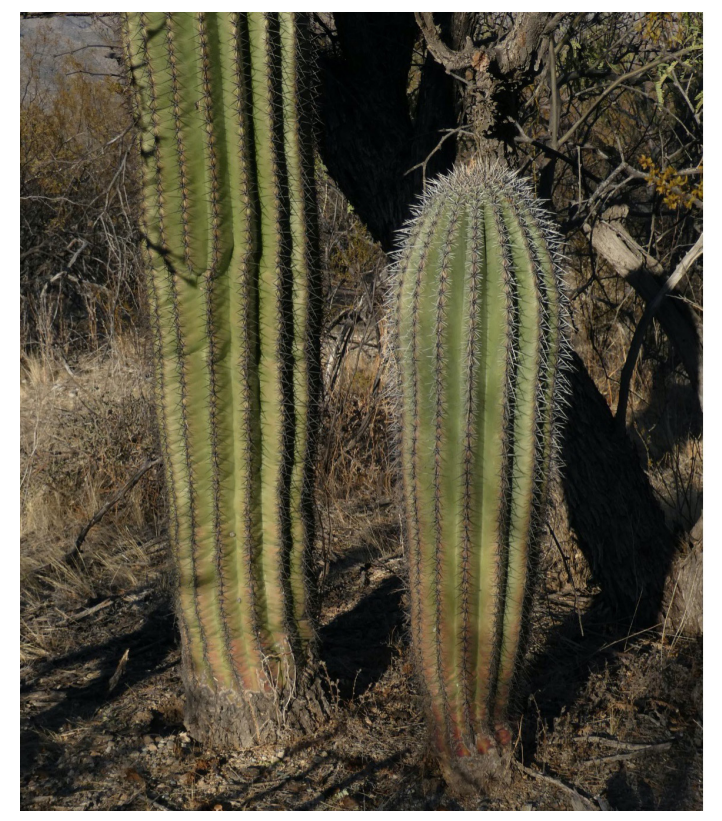
Figure 7. Narrowing trunk flare (right) and/or a bark-like base (left) of the saguaro is seen where the stem meets the soil.

Arborists inspecting woody trees will look for trunk flare, a widening of the trunk at the point it meets the soil. Widening of the trunk just above the soil surface is a sign of good trunk flare that bodes well for health of a tree. Saguaro exhibit no trunk flare, or a narrowing (inverse) trunk flare. Young saguaro stems pinch to a narrowed diameter just above the soil surface, as is typical of a barrel cactus. In older saguaro this narrowing trunk flare is usually not evident. The older saguaro stem has widened through secondary growth of wood inside the trunk. The expansion ruptures the skin of the once-narrow base, which becomes bark-like as it expands. The trunk base of an older saguaro can resemble a gray-skinned elephant's foot (Figure 7). Roots spread out horizontally just below the point where the stem meets the soil.