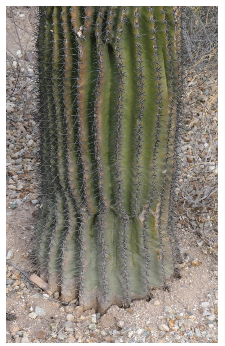
Figure 8. Saguaro stem meeting the ground with no transition, a sign the plant has been planted too deep.

The practice of deep planting is supposed to give the saguaro more stability immediately after planting, but if this is detrimental to the life of the plant, that is a poor tradeoff. A tall saguaro planted at the correct depth will require stabilization braces for at least two years during establishment while a root system forms. The need for braces can be avoided by planting younger smaller saguaro.