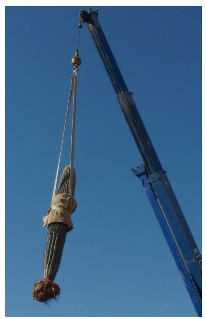
Figure 6. A saguaro spear moved by a crane for careful landscape placement.

recommendation may seem to be contradicted by the visibility of large multiple-armed saguaro which have been planted along many Arizona roadways. Their transplanted condition is obvious by the presence of support braces, which may be left in position for many years. These saguaro have been moved as part of construction and road work operations (Arizona Game and Fish Department 2019). Native plant ordinances often require salvage and relocation of qualifying native plants in these circumstances. The low survival rate of these saguaro is considered acceptable when the alternative would be their destruction. Best Management Practices for translocating saguaro for restoration have been detailed by the Arizona Game and Fish Department (2019).