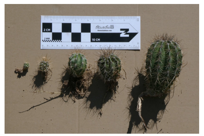
Figure 1. Saguaro seedlings, still too small to be good candidates to plant into the landscape.

Seedling saguaro under three inches in height are poor prospects for planting into the landscape. These cacti have not yet produced stout protective spines and are still weaning off the higher water needs of seedlings (Figure 1). Saguaro in the 6-8 inch height range, or those sold in number 1 (onegallon) nursery containers are reaching a minimum size for planting in the ground with good success (Figure 2). The nurse plant relationship which is crucial for saguaro seedling establishment (Banks 2008) is not required for planted saguaro. Planting under a tree is not advised, to avoid future contact between the growing saguaro and branches above. However, temporary shading should be provided for the newly planted saguaro.