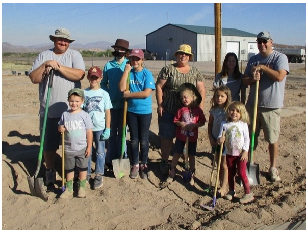
Soil and water lines crew

Thanks to our enthusiastic volunteers, the Annual Pumpkin Patch is up and growing!