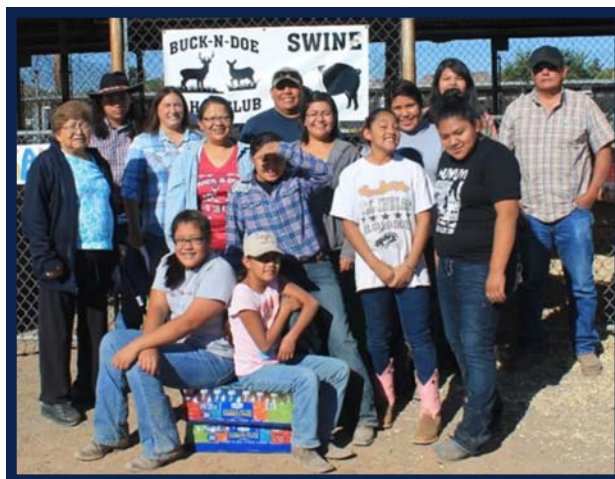
Hualapai 4-H members, volunteer leaders, and family pose for the camera at the 2016 Mohave County Fair.

Hualapai FRTEP works closely with the Hualapai Department of Natural Resources. We are focused on getting a building constructed at the 4-H Agricultural Facility. This building will provide a space for 4-H clubs and other groups to hold meetings. It will also house Hualapai Cooperative Extension and the Hualapai Nation Soil & Water Conservation District. Plans for the building include a fully equipped kitchen, which will not only encourage the expansion of 4-H cooking classes, but the Buck-N-Doe 4-H Club will have a location out of which to base their fund-raising and catering events. Tribal Council has approved the building design, construction bids have been submitted, and a contractor has been selected and fundraising continues as the site is under development.