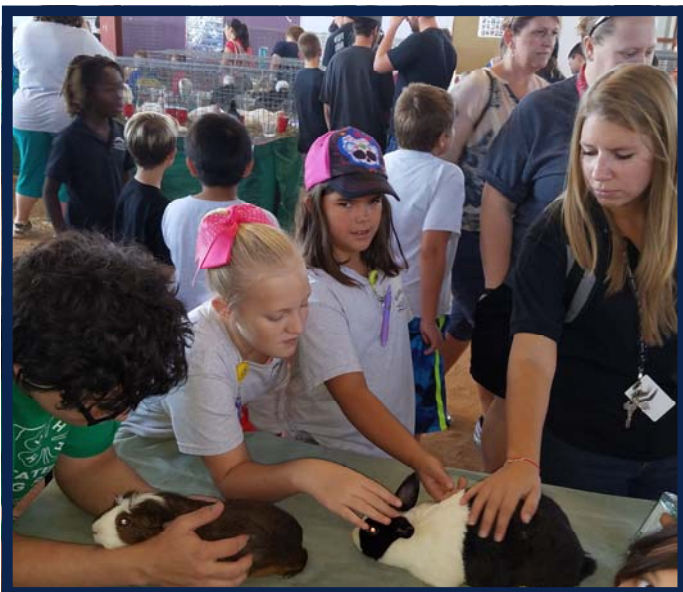
Youth are able to pet a rabbit for the first time during the 4-H Meet & Greet at the Mohave County Fair.

One hundred and fifty three members displayed 952 exhibits at the Mohave County Fair in the 4-H/FFA Division. Of these, 80% were rated as Blue Ribbon or above for their project work and skills demonstrated served as a showcase for Mohave County 4-H Youth to exhibit what they had made and learned.