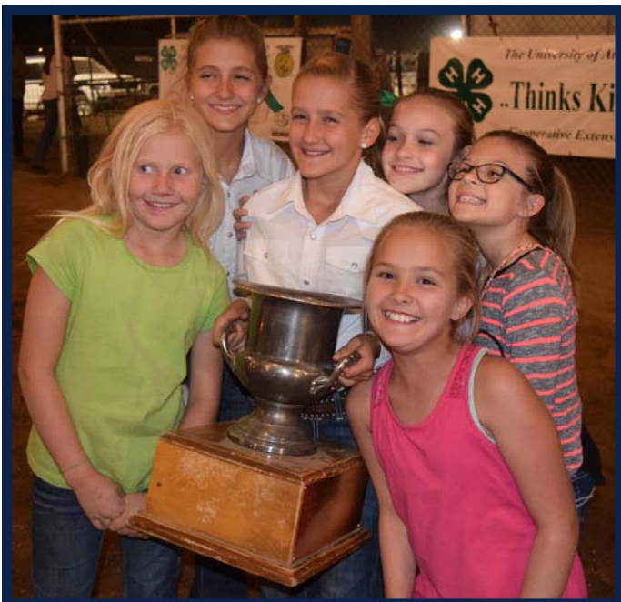
4-H club members pose with their 2016 Champion Round Robin Livestock Showmanship winner.

Mohave County 4-H offered many opportunities for youth to develop skills that will serve them for a lifetime. These program and events included: 4-H Interstate Exchange Program, 4-H Awards Program, County Recognition Night, Demonstration Day, Family Fun Day, and the Mohave County Fair. Thirteen teens and adult leaders planned and coordinated the 4-H Interstate Exchange program. Mohave County 4-H members hosted 4-H members from Rensselaer County, New York (Troy), to stay with 4-H families, and toured the agricultural as well as historical sites and National Monuments and Parks in and around Mohave County. At Mohave County 4-H Challenge Days, 78 members represented 11 clubs which entered in 16 contest areas. During these contests, 63 members received a score of 80% or higher indicating an advanced level of competency.