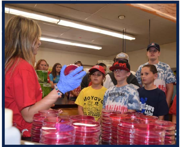
4-H members attending the Carcass Contest in Tucson get a first hand look at the University of Arizona Meats Lab and learned about how meat is sampled for bacterial contaminants.