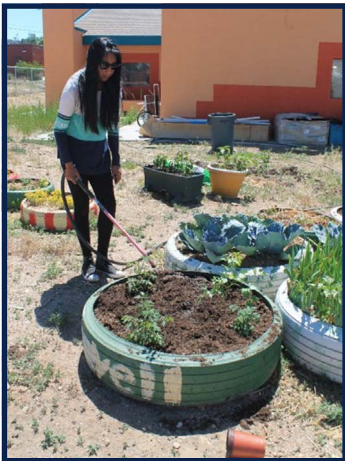
Youth prepared beds and planted the garden at the Boys and Girls Club.