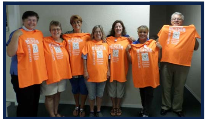
2016 Inaugural Hunger Awareness Walk Participants, Lake Havasu City.