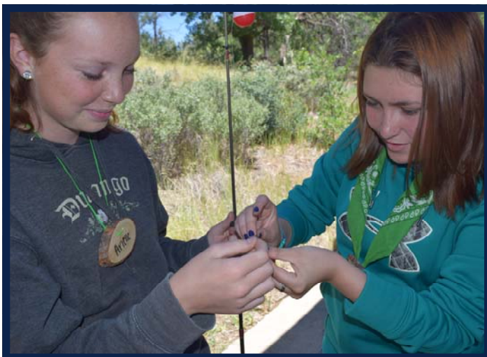
Mohave County 4-H'ers put a worm on a hook for the first time at a fishing workshop during Summer Camp.