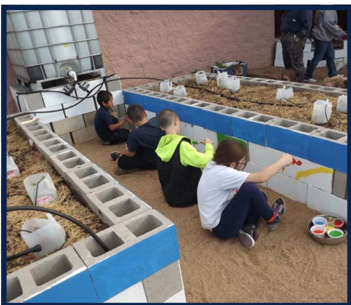
Cerbat Rams Garden Club taking ownership of garden beds. Students painted their garden bed areas with their own designs.

Two full time staff are engaged in food demonstrations and nutrition education lessons with 20 approved sites including Tribal Nations, schools, food banks, and retirement centers. 121 site visits were conducted reaching over 2,200 adults and 800 youth. Other important landmarks achieved in 2016 were: establishment of the Kingman Farmer's Market; organized the inaugural Hunger Awareness Walk in Lake Havasu City; and developed 6 new school gardens in Mohave County.