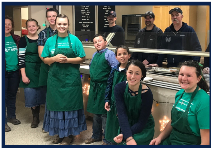
Lonesome Valley Wranglers 4-H club serving holiday meals.

Yavapai County has several county-wide shooting sports programs for 4-H youth. In 2020, twenty-seven members participated in the shootings sports projects. Eight youth participated in archery; sixteen were a part of the small bore rifle program, ten were a part of the air rifle program, and two were involved with shotgun.