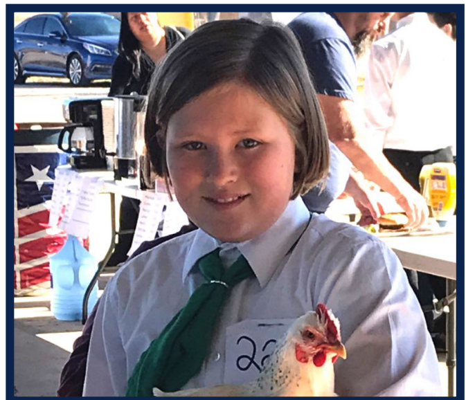
Prescott Valley Clovers member showing her poultry at the CRSSS.

The 2020 Yavapai County 4-H/FFA EXPO Show and Sale was a little different as an online auction option was provided for 4-H and FFA youth due to the COVID-19 mandates and the inability to hold the 71 st annual show and sale. The online auction was held April 25-May 1. Members who raised an animal or completed a project could sell their projects at auction. 4-H youth use their profits from the sale to help fund their education and future livestock purchases. The 2020 Verde Valley Fair also held an online auction on May 2 nd and was open to 4-H and FFA youth in the Verde Valley. In addition, 4-H members could participate at the Yavapai County Fair Youth Livestock Show and Sale held September 12 th .