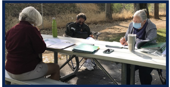
Volunteers judging record books at Granite Creek Park in Prescott.