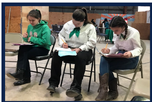
4-H youth participating in knowledge-based tests at CRSSS.

Eighty-four youth from seven counties participated at the Colorado River Small Stock Show held January 18-19 in LaPaz County. Yavapai County Cooperative Extension staff provided fifty-seven knowledge-based tests for small stock species. In addition, six teams participated in a quiz bowl consisting of thirty-six members. Two hundred sixteen animals were exhibited, while youth participated in one hundred twenty-nine showmanship classes, and fifty-seven judging contests. Yavapai County 4-H is the host of this event in Cottonwood every three years and is scheduled to host again in January 2023. The 2021 show was cancelled, but will be held in Mohave County in 2022.