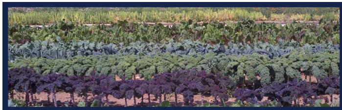
Several varieties of kale growing at Whipstone Farm.

between the program and the growers. The CDC guidelines were followed during all farm visits.