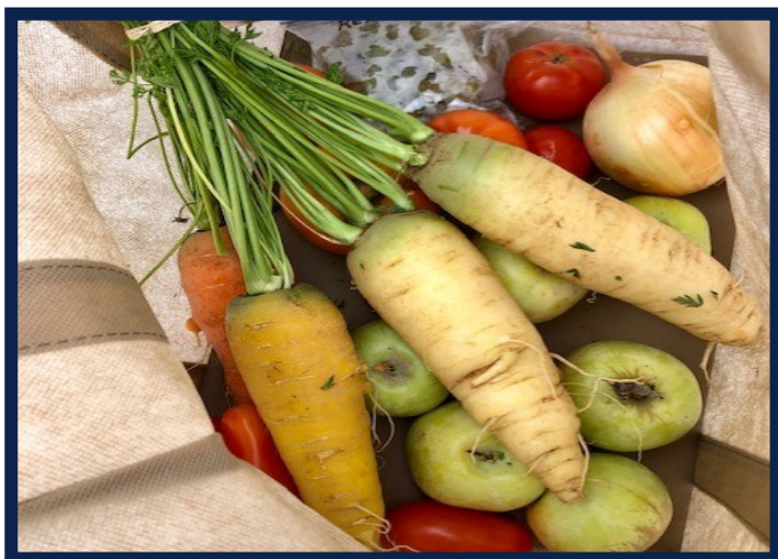
The Farmers Market Nutrition Program (FMNP) packed and distributed fresh produce from local farms to senior residents.