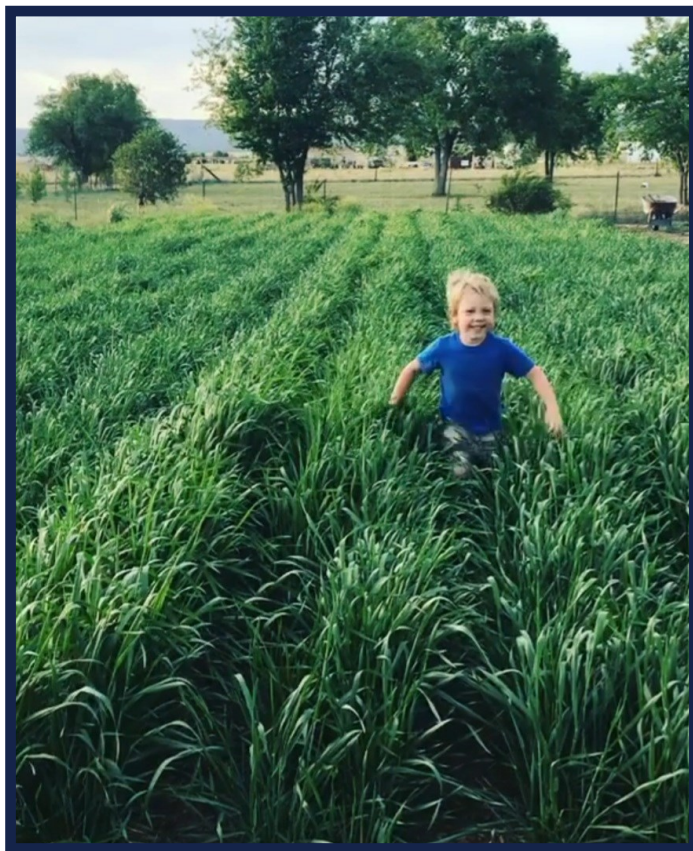
Winter wheat growing at Schaffer Farms, Paulden, AZ.

Annual Conference on the topic "Innovative Fertilization Strategy-a Potential for Improving Performance of Plant-Growth Promoting Microorganisms."