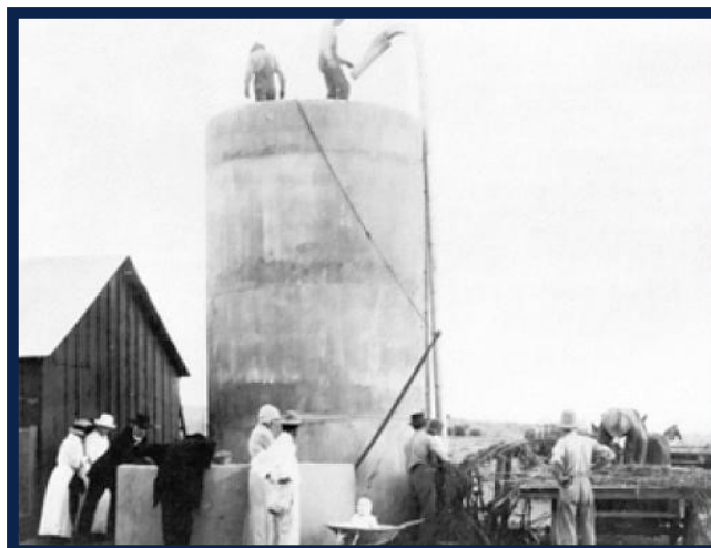
Filling the silo at the U of A Prescott Dry Farm which was in operation between 1912 and 1927.

Yavapai County Cooperative Extension 840 Rodeo Dr # C Prescott, AZ 86305 928-445-6590 ext. 224 jschalau@cals.arizona.edu