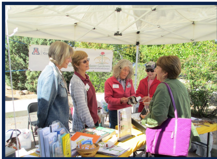
The Master Gardener information table at the Prescott Farmer's Market provides science-based gardening information to the public.