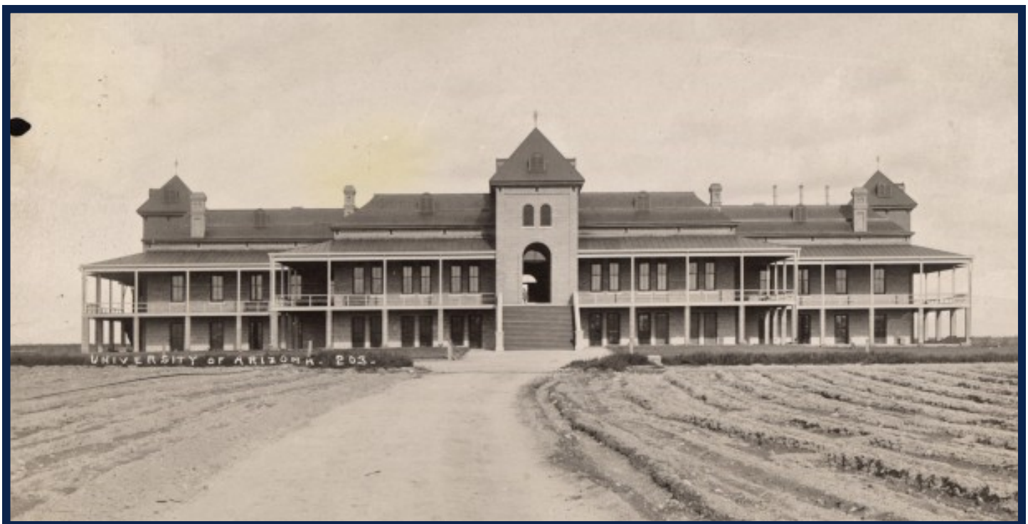
Old Main, constructed in 1891, was the original University of Arizona Building. Designed in a style often referred to as 'territorial hybrid', the building was sunk six feet below the surface so the ground would help minimize the effects of the warm Tucson summers.