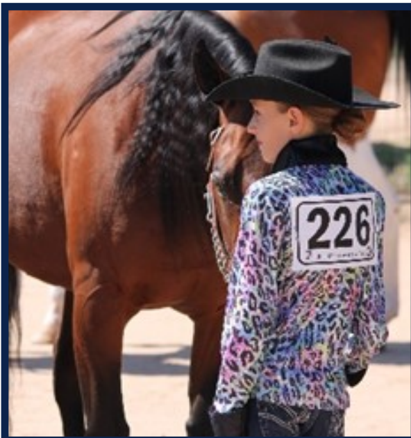
The 4-H Horse Project teaches youth how to care for and show horses.

Yavapai County 4-H community and project clubs were led by 46 adult volunteers. Yavapai County 4-H clubs reached over 172 youth participating in projects ranging from sewing/textiles, leadership, livestock and small stock, to horse and outdoor adventures.