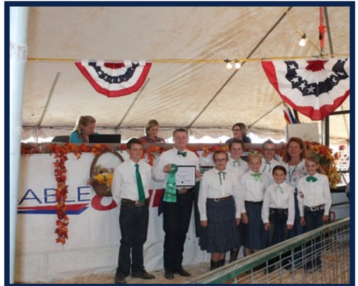
Yavapai County 4-H Members presenting their award certificate at the 2016 4-H/FFA EXPO.

The Verde Valley Fair is held each May and is also open to 4-H youth participation. 4-H members from the Verde Valley and nearby areas exhibited their projects at the Verde Valley Fair and many sold them at the Verde Valley Junior Livestock Auction.