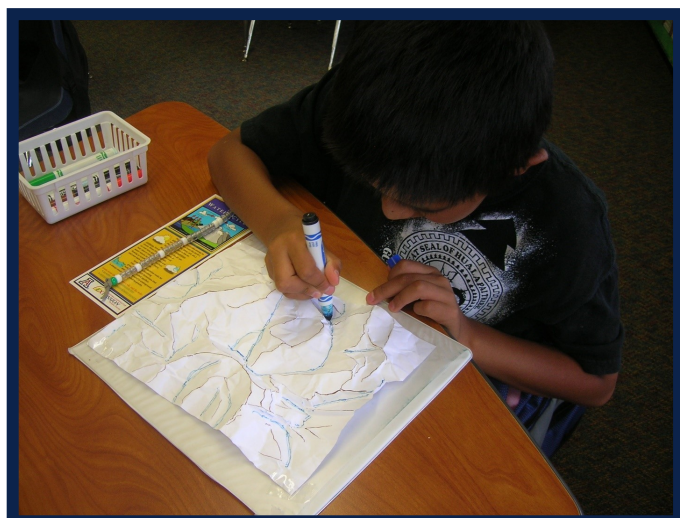
A fourth grade student at Seligman Elementary School creates a watershed map to learn about the impacts of human activity on water quality.