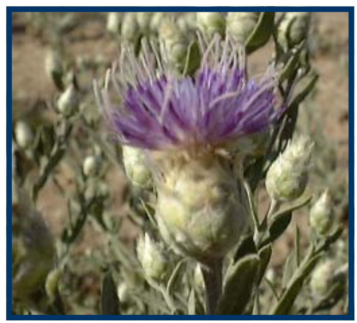
Russian knapweed is one of the persistent perennial noxious weeds found in many areas of Yavapai County.

across Arizona participated in this diverse camping experience. The workshop utilized experienced natural resource professionals and University of Arizona faculty as instructors to build skills/competencies of the youth participants and continues to be the preeminent natural resource camp experience in the state of Arizona.