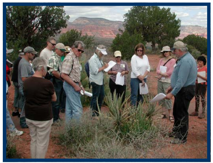
Master Gardeners learning to identify native plants near Sedona.

In 2011, 163 Master Gardeners contributed 15,725 hours of volunteer service to citizens and institutions of Yavapai