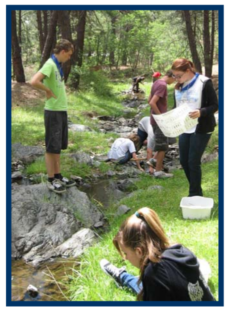
Students investigating water quality at Mingus Springs Camp.

120 seventh students grade participated in the Cottonwood Middle School (CMS) Water Audit. CMS students calculated water usage at their school before and after water saving devices were installed. Students were able to see real water savings after installations of simple water devices saving such as faucet aerators.