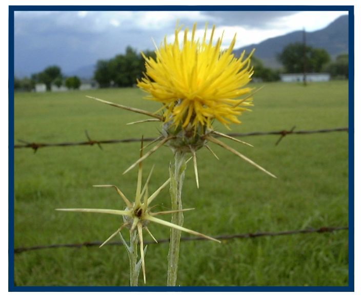
Yellow star thistle is a noxious weed invading wildlands across the temperate zones of the western United States. California currently has 14 million acres infested with yellow star thistle.

youth from across Arizona participated in this diverse camping experience. The workshop utilized experienced natural resource professionals and University of Arizona faculty as instructors to build skills/competencies of the youth participants and continues to be the preeminent natural resource camp experience in the state of Arizona.