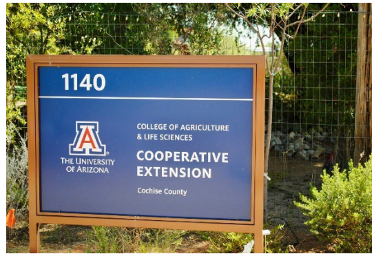
Sierra Vista Office