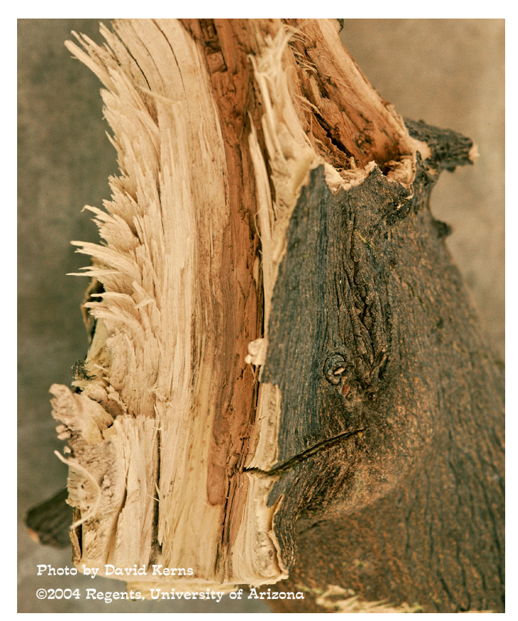
Figure 7. A broken branch in lemon caused by infection by the wood decay fungus Antrodia.

with Coniophora, whereas white fungal mycelium can be observed within the brown decayed wood infected with Antrodia (Figure 7).