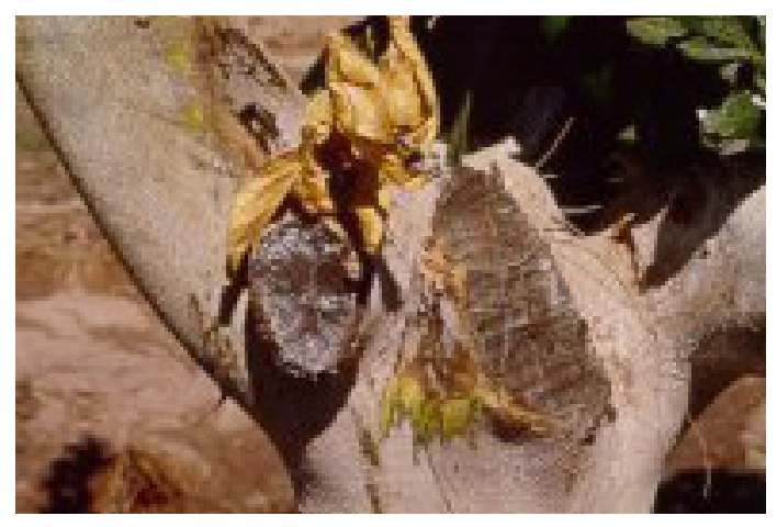
Figure 5. Symptoms of sooty canker caused by Hendersonula toruloidea.

Citrus macrophylla, Cleopatra mandarin, and Troyer citrange. Over-irrigation resulting in soil saturation is detrimental to normal feeder root development even in the absence of Phytophthora . It is important to dig a planting hole as deep as necessary to obtain good drainage. Caliche layers, commonly found in our low rainfall, alkaline soils, should be opened up to allow water drainage and unrestricted root development.