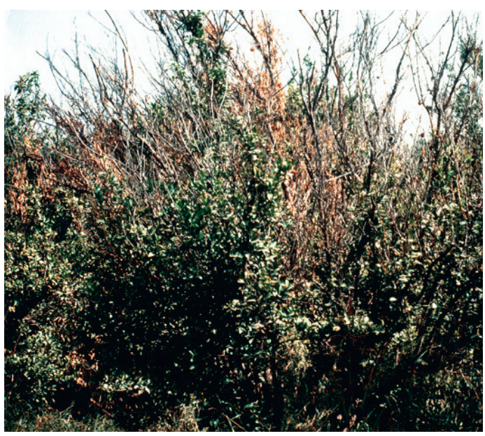
Figure 1. Non-specific symptoms in citrus of general tree decline with tip die back and sparse foliage. This condition could be caused by several factors including Phytophthora crown and root rot, citrus nematode, or nutrient deficiencies or excesses.

One of the most important diseases found in citrus in Arizona is caused by the citrus nematode ( Tylenchulus semipenetrans ). This disease has become more widespread and important because present control options are limited.