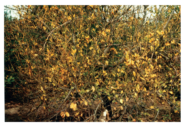
Figure 10. Advanced symptoms of citrus tristeza virus.

Symptoms: Symptoms of CTV in citrus are extremely variable and depend on the isolate of the virus, host, environment, and scion/rootstock relationships. Common symptoms include reduced fruit size, leaf vein-clearing, yellowing and cupping of leaves, and stem pitting. Depending on the symptoms on different hosts, isolates of CTV can be categorized into four categories. Mild strains cause very mild symptoms and slight yield reductions on a variety of citrus. Quick decline strains are most severe in