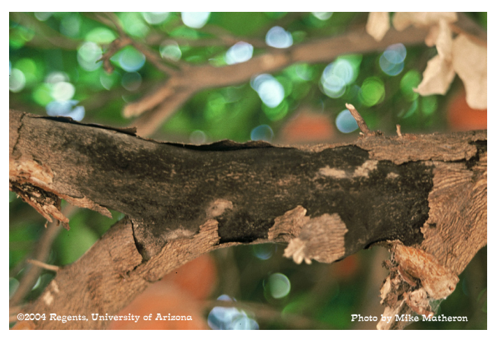
Figure 6. Branches with the black "soot" of sooty canker disease.

Biology of the pathogen: In Arizona, H. toruloidea produces only conidia and thus has a very simple life cycle. The small conidia, produced in black, powdery masses under bark, are easily wind disseminated. These spores, which