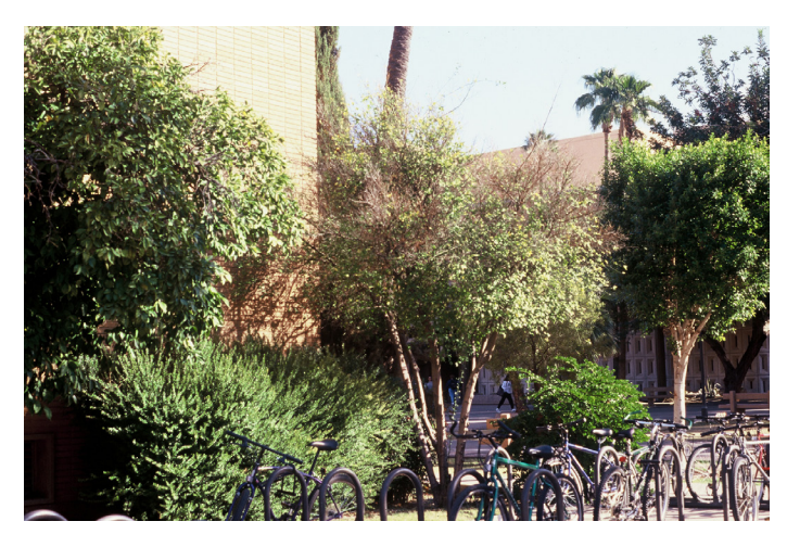
Figure 12. Slow decline of citrus infected with citrus nematode.

Control: No chemicals are presently recommended for postplant control of the citrus nematode.