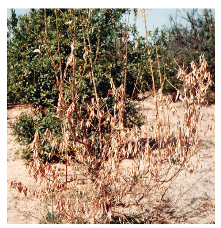
Figure 13. Freeze damage in lemon. Young trees may be killed.

Water stress: A slight wilting of leaves indicates that a tree does not have enough water and irrigation is needed. New leaves show leaf rolling, the first sign of water stress. Long droughts may cause defoliation and dieback. In Arizona, hot dry winds may accentuate moisture stress and cause leaves to dry up on the tree. In young leaves, chlorosis may occur on the leaf blade between the midrib and the leaf margins. These chlorotic (yellowish) areas may later turn gray to light brown. This condition is referred to as "mesophyll collapse." Damage to surface roots by disking or plowing during water stress situations may accentuate this symptom.