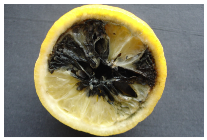
Figure 8. Internal Alternaria infection in lemon fruit.

capable of causing infection. Post-harvest application of selected fungicides can help delay the development of blue and green mold, especially in combination with immediate cooling of fruit after packing.