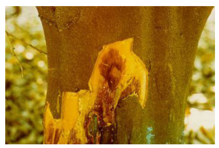
Figure 4. Typical discoloration under the bark of the trunk of an active lesion caused by P. nicotianae .

Fruit infections, although not common in southern Arizona, may occur during or shortly after warm rainy periods during summer and fall. These infections are caused by motile spores being splashed onto fruit. This stage of the disease is called brown rot, since the diseased areas on the fruit are brown in color. Active growth of trunk lesions occurs during May and June, declines somewhat during the hot summer months of July and August, and resumes during September and October.