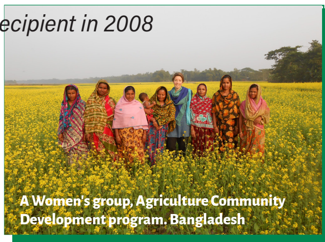
A Women's group, Agriculture Community Development program. Bangladesh