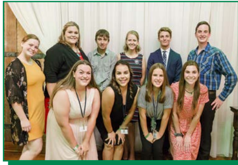
Arizona 4-H Summit Leadership Team

Arizona 4-H inspires kids to do. 2019 was a year of expanding opportunities for 4-H members. For the first time in over 25 years, a sea of green in the form of high school from nearly every Arizona county converged on the University of Arizona this summer to learn about campus, career and community from university experts and current students.