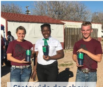
Statewide dog show