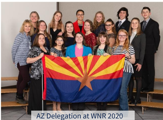
AZ Delegation at WNR 2020