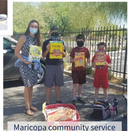
Maricopa community service