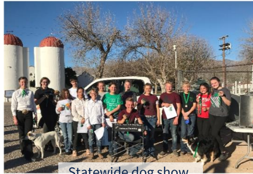
Statewide dog show