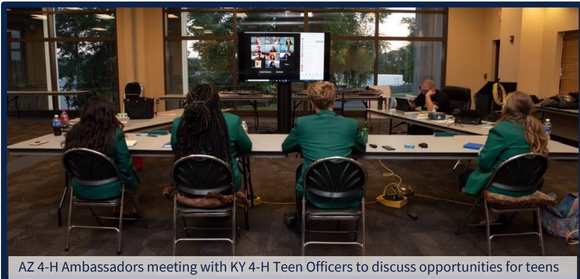
AZ 4-H Ambassadors meeting with KY 4-H Teen Officers to discuss opportunities for teens