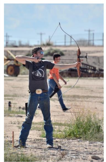
Statewide archery match