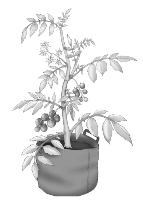
Figure 2: Illustration of tomatoes in a grow bag. By Evan Adams.