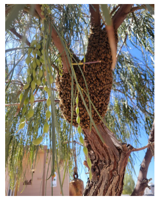
Swarm of bees in a tree

Every spring Mother Nature makes more bee colonies by doubling those that survived the winter. Once the weather has warmed and there are good sources of nectar and pollen available to raise brood, as well as some new drones available, the queen will lay a few eggs in queen cups at the bottom of the comb. These queens take 15 days from egg to hatching, so usually sometime around day 9 half the colony will leave the hive with the old queen. The old hive is left with approximately half the worker bees, the comb, lots of brood, and hopefully good stores of food. The new queen will emerge on day 15, get mated within the first week or so, and within a few more days will start to lay more eggs.