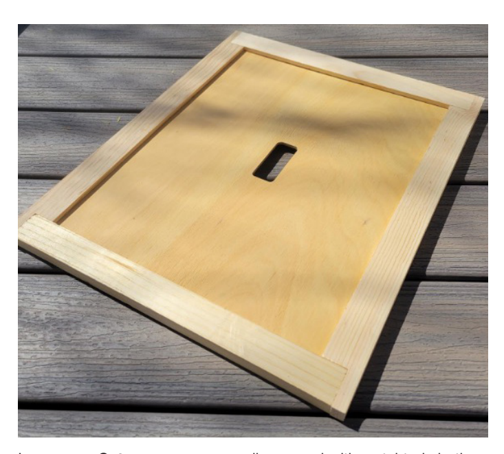
Inner cover Outer covers are usually covered with metal to help them reflect light and stand up to rain.