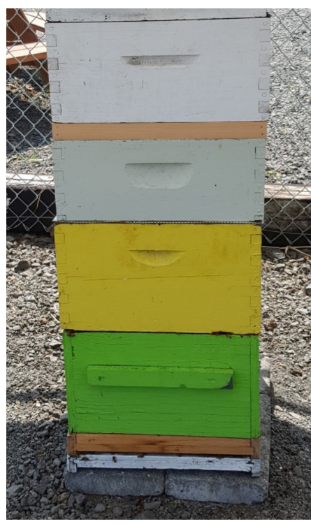
Two deep hive bodies with two honey supers on top Purchasing a Complete Hive

There is sometimes the option to purchase a complete working hive from a beekeeper who is moving or downsizing. Be sure to thoroughly check the bees for health and freedom from diseases and pests. Inspect the frames and the bottom board for signs of issues and to assess the strength of the queen. Make sure that the purchase price is about half of what the equipment and bees would cost new. Keep the new bees isolated from the rest of your hives for several weeks to make sure they are free from pests and diseases that might infect your other hives.