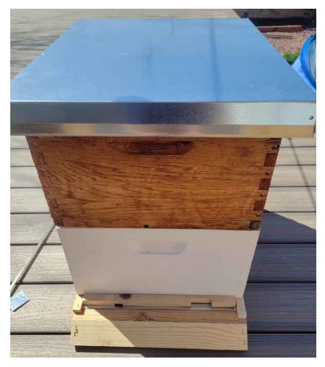
Two deep brood boxes with metal outer cover

If you install your Nuc in the spring and there is good weather and floral resources, they will fill all the frames in the bottom brood box quickly. Once they have filled the bottom box 80% and at least built the outside frames with honeycomb, it's time to add another deep brood box on top of this one. Once they fill the second deep brood box, it is time to add a Queen Excluder on top (to keep your queen down below and not laying brood in the honey supers) and a Honey Super .