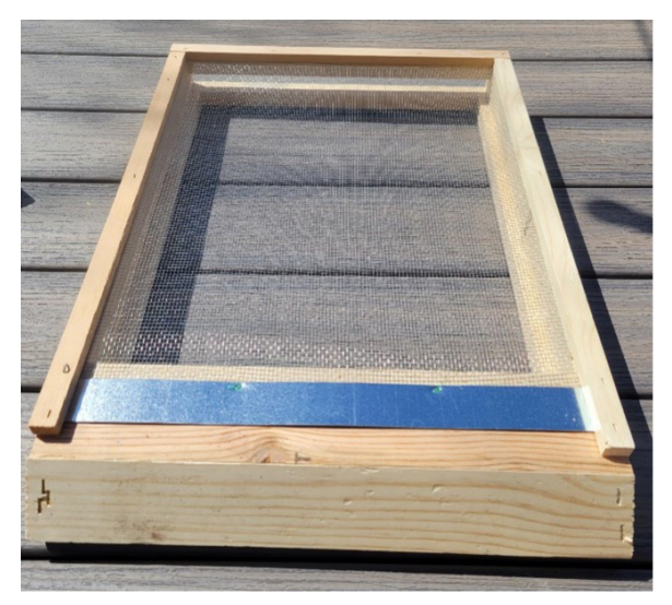
Screened bottom board

Hives usually are made from wood, so they should be placed on an elevated hive stand . This is both to get the hive up off the ground so the wood bottom board doesn't rot, but also to place the hive at a more comfortable working height. A hive stand with four legs is good for areas with ant problems. A can of oil can be placed under each leg which creates a barrier they can't cross. The next piece of equipment is the bottom board. Traditionally these were a solid piece of wood, but new advances have found several reasons to use a Screened Bottom Board instead. The screen allows for ventilation in the summer, as well as a way to remove debris from the bottom board without disrupting the colony. Screened bottom boards also allow for insertion of a sticky board for monitoring mite drop following a mite treatment.