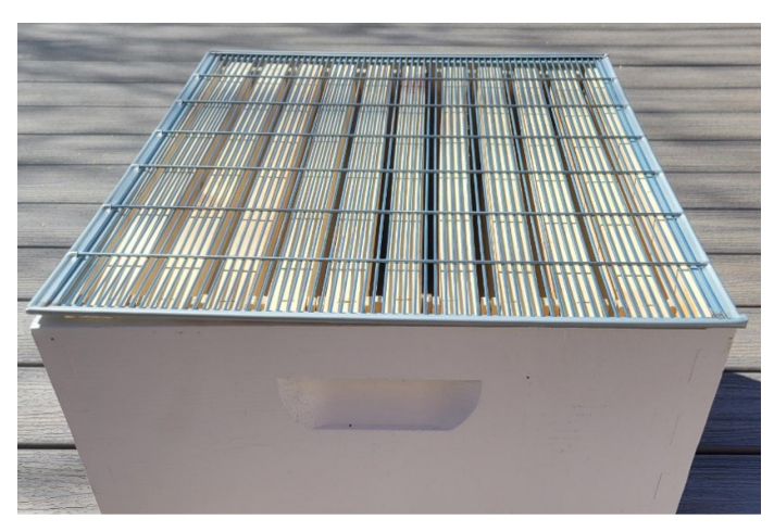
Deep brood box with metal queen excluder on top

Honey supers are a little more shallow than the deep boxes, and they are used solely for collecting honey. The bees will start in the middle of the box and build comb and fill it with honey. As the middle gets full and capped they will start working their way out to the sides. Once this honey super is 80% full you will add another honey super. Usually, you will lift the nearly full honey super and place the empty honey super underneath. As the bees walk back and forth over the empty super, it will smell like their colony and they will start to build comb and fill it. You can keep adding honey supers as needed, but usually beginners will only need one or two.