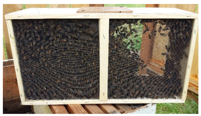
A 'Package' of bees consists of approximately three pounds of worker bees, a container of sugar syrup to feed them on their journey, and a virgin queen in a cage.

Packages of bees are usually around 3 pounds of bees that have been shaken into a screened box and given a newly mated queen that may or may not have started laying eggs. They come with a can full of sugar syrup to feed them during the days of transport, but you should install them into your hive box as soon as possible. First, you remove the queen cage and attach it between two frames in the middle of the box. Then you will remove the feeding can, which also acts as the plug, and start shaking the bees into your hive box on top of the frames where you placed the queen cage. You should then place some sugar syrup feed on the hive to stimulate the workers to start producing all the comb they need for their new hive. The queen will not