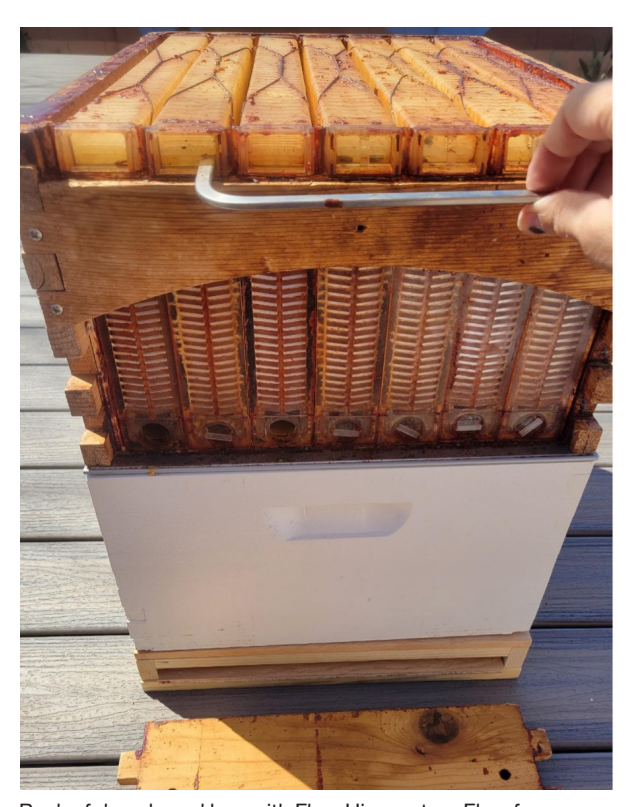
Back of deep brood box with Flow Hive on top. Flow frames are exposed getting ready to harvest honey.

Honey supers are a little more shallow than the deep boxes, and they are used solely for collecting honey. The bees will start in the middle of the box and build comb and fill it with honey. As the middle gets full and capped they will start working their way out to the sides. Once this honey super is 80% full you will add another honey super. Usually, you will lift the nearly full honey super and place the empty honey super underneath. As the bees walk back and forth over the empty super, it will smell like their colony and they will start to build comb and fill it. You can keep adding honey supers as needed, but usually beginners will only need one or two.