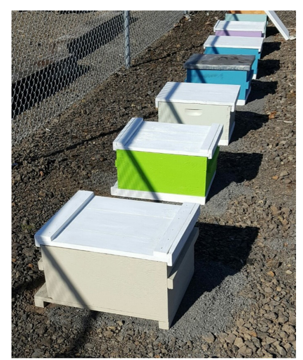
Nicely spaced hives on level ground facing south

Once you have your Beekeeping equipment ready, it's time to think about the best place to locate your hives. Bees make many people nervous, so it's important to be a good neighbor and put some thought into where to locate your hive so that it won't bother anyone else. Many of us would like to keep our bees in our own backyard, but if you live in a densely populated neighborhood unless you have a very large yard, it would be best to locate your apiary on a farm or rural property. The first consideration is to look around the location to see if there are enough floral resources within a 1-mile radius throughout the year to feed the bees. It usually takes one hive of bees to pollinate one acre of orchard trees, but many floral resources only bloom for a few weeks a year. Healthy bees need to have a rich variety