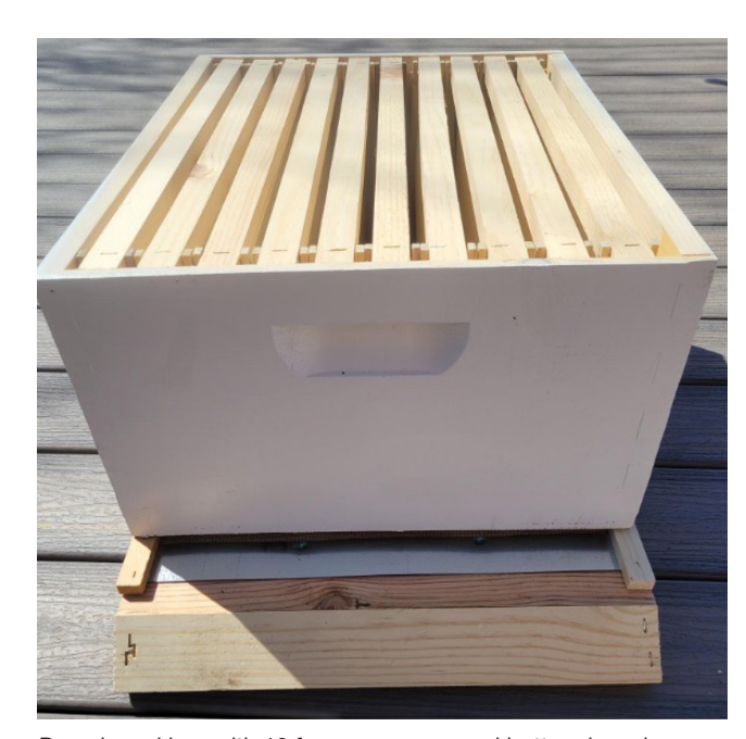
Deep brood box with 10 frames on screened bottom board

If you install your Nuc in the spring and there is good weather and floral resources, they will fill all the frames in the bottom brood box quickly. Once they have filled the bottom box 80% and at least built the outside frames with honeycomb, it's time to add another deep brood box on top of this one. Once they fill the second deep brood box, it is time to add a Queen Excluder on top (to keep your queen down below and not laying brood in the honey supers) and a Honey Super .