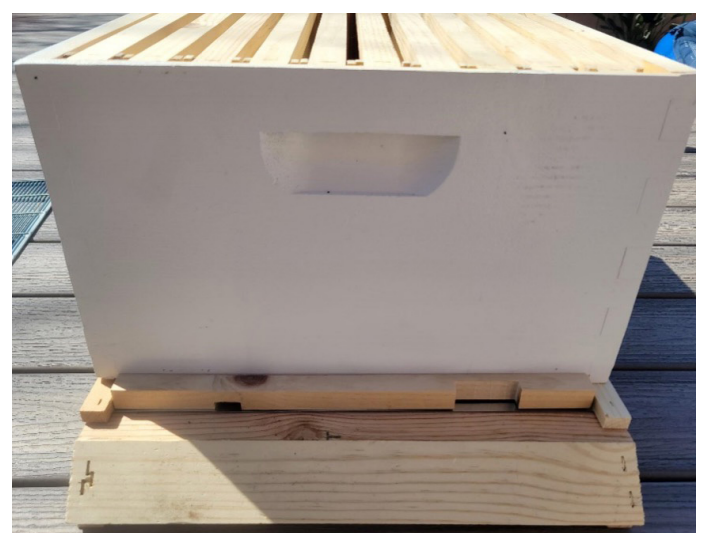
Deep brood box on top of bottom board with entrance reducer

Outer covers are usually covered with metal to help them reflect light and stand up to rain.