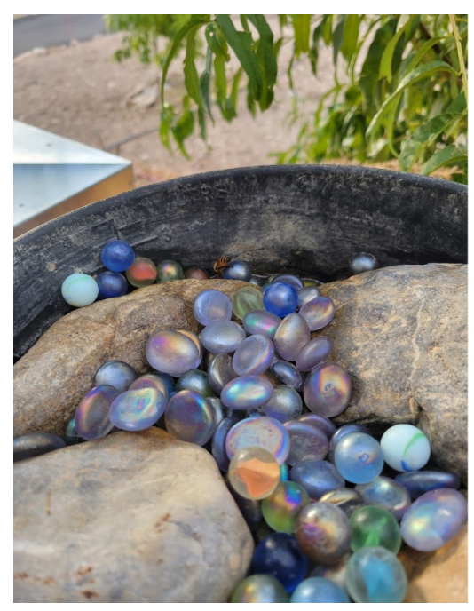
A water source for bees can be a shallow container with rocks and glass pebbles for the bees to land on.