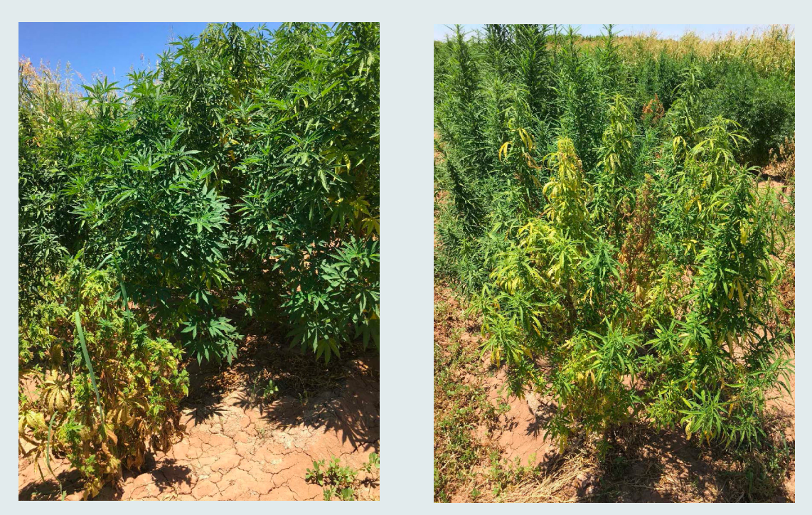
Late stage disease symptoms: Severe stunting and yellowing