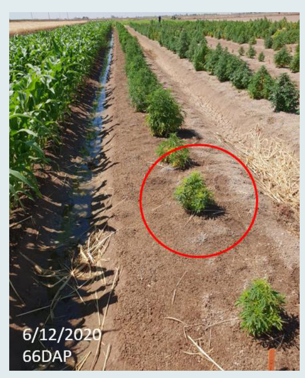
Early stages of stunting and yellowing

the beet leafhopper insect. BCTV typically causes upward curling of the leaves associated with vein clearing and the tumorous outgrowths (enations on the lower surface of veins) as well as a reduction in chlorophyll content and the rate of photosynthesis. The resulting curly top disease significantly reduces yield potential of the plant if it is infected at young age. Due to the wide distribution of beet leafhoppers and abundant range of host plants for the virus, BCTV may become one of the most yield limiting factors affecting the emerging industrial hemp production systems in Arizona.