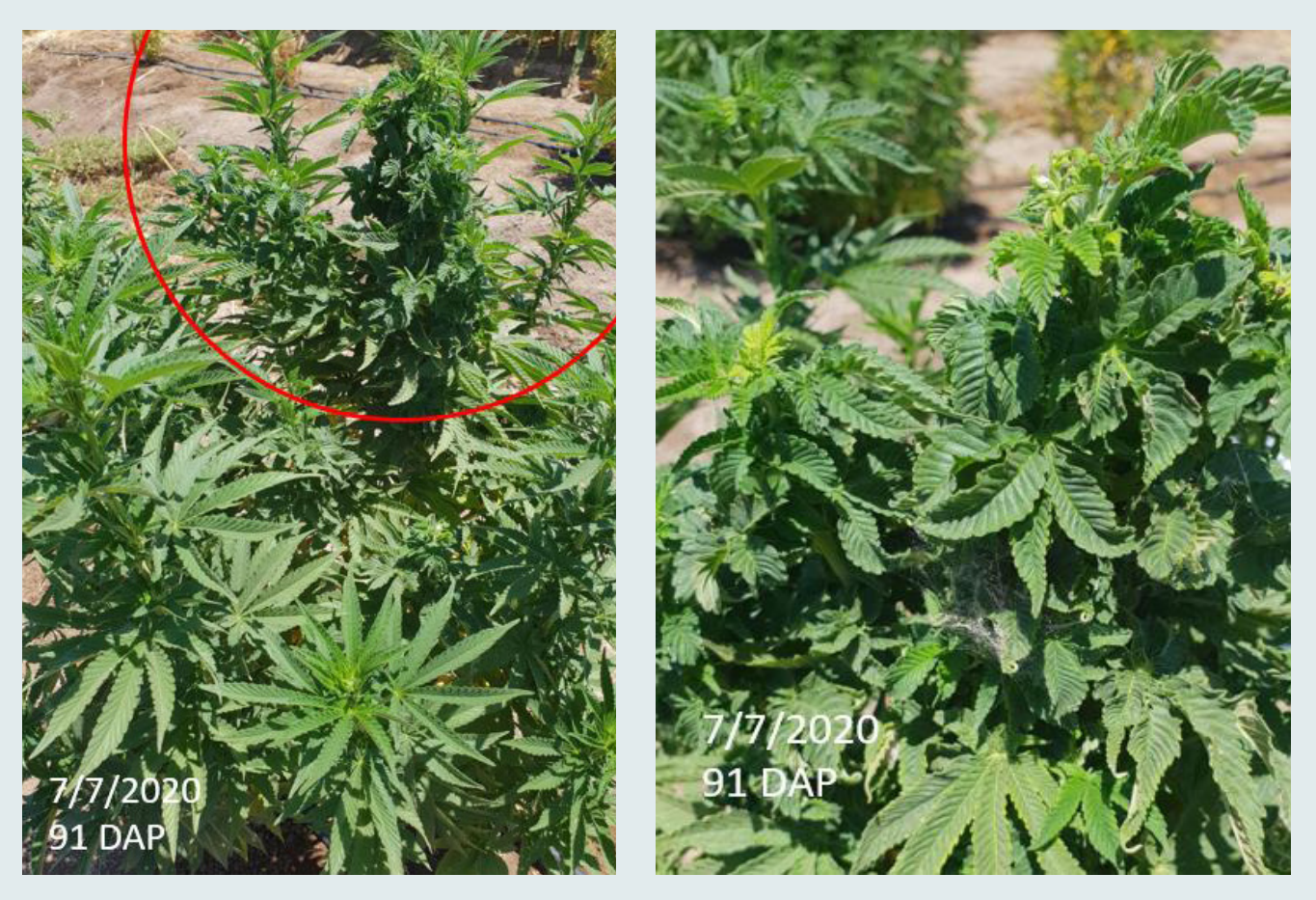
Severe leaf twisting and chlorosis symptoms of a hemp plant infected with BCTV