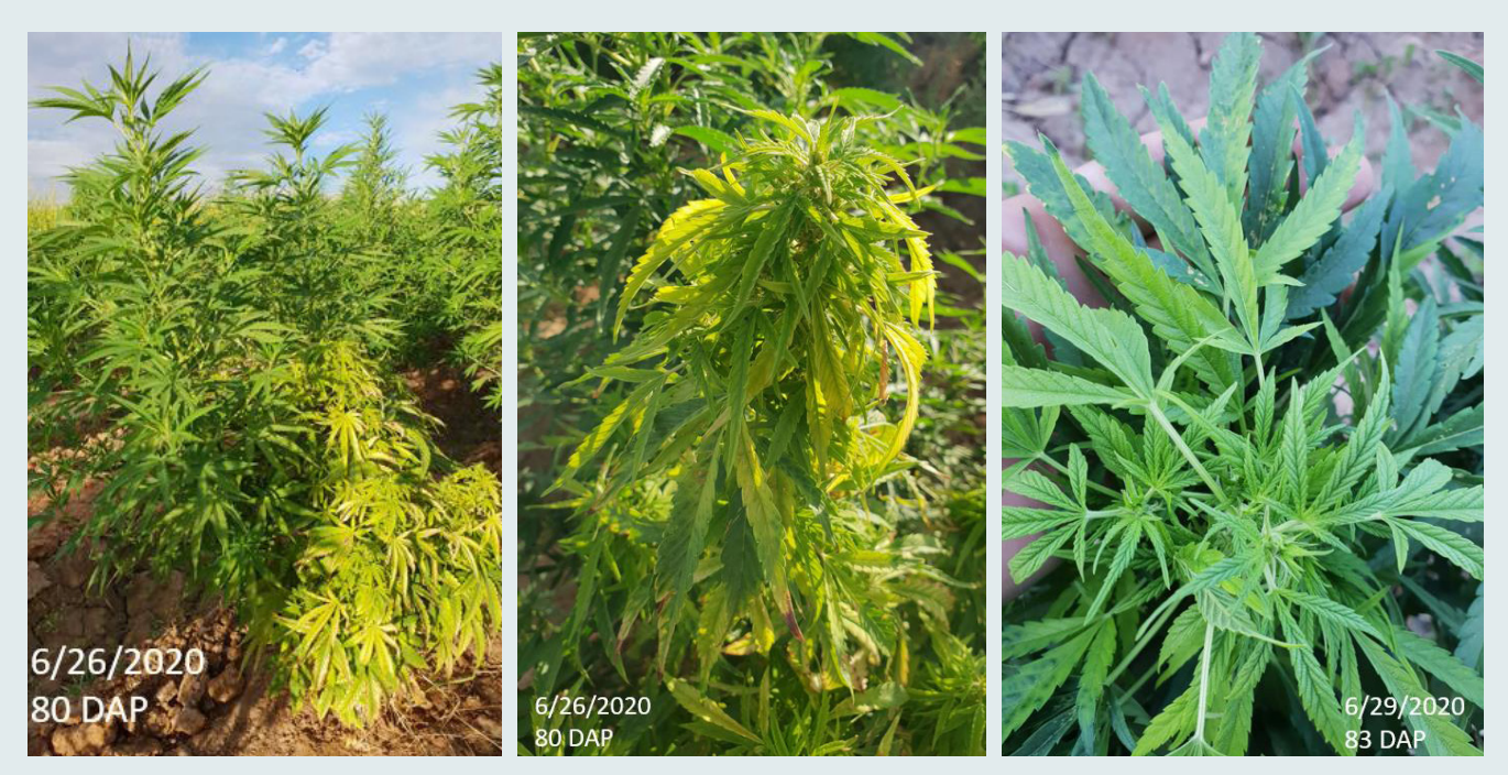
Yellowing and stunting (note asymptomatic side branches)