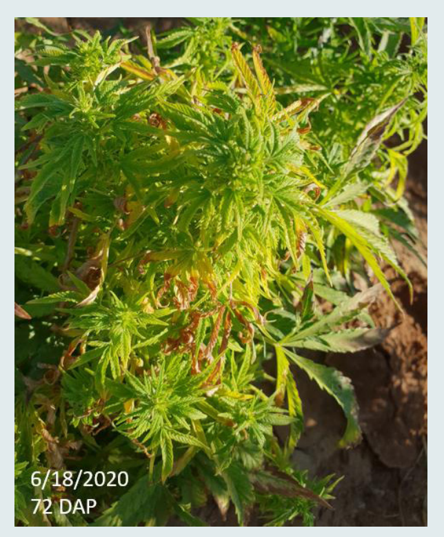
Yellowing and necrosis