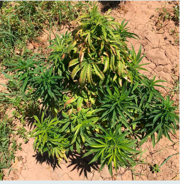
Severely stunted hemp plant with side branches that may (left) or may not (right) outgrow the BCTV infection