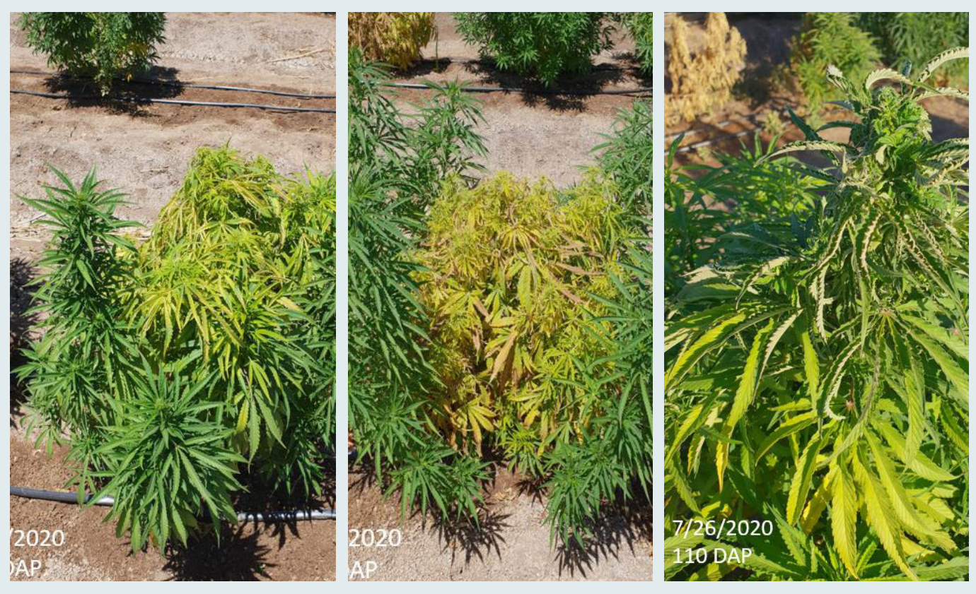
Mid-stage of yellowing and stunting (note side branches appear to be symptoms free)