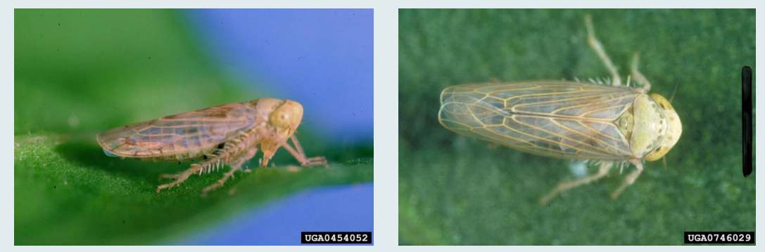
The adult beet leafhopper (0.12 inches in length) and greenish, yellow, tan or olive in color, with or without darker markings on its wings and body