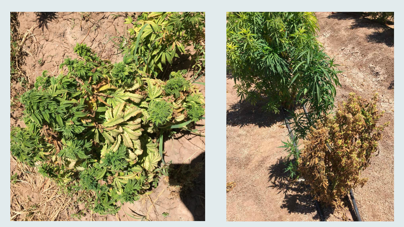
Severe stunting and death of a young infected plants in mid-growing season