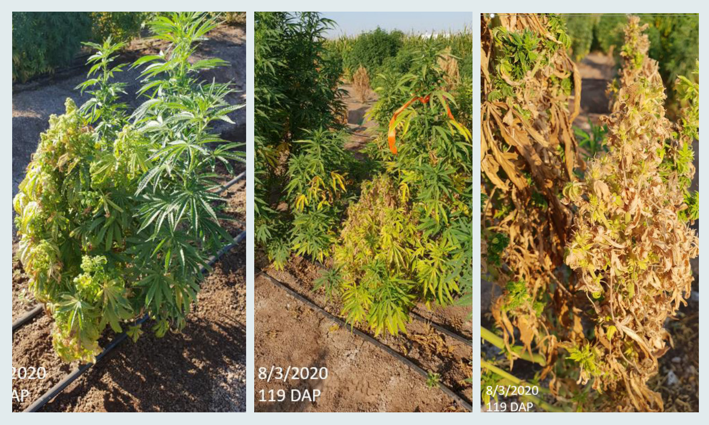
Late-stage severe yellowing, stunting, and death of hemp plants infected with BCTV