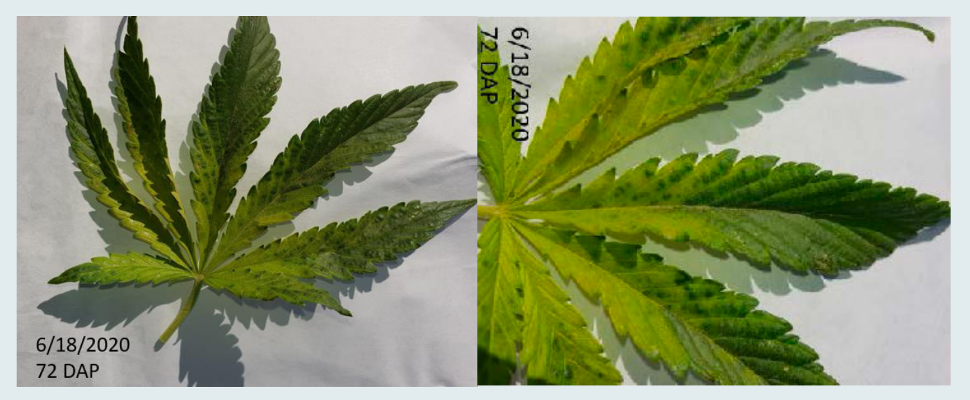
Early mosaic symptom of BCTV on hemp leaf