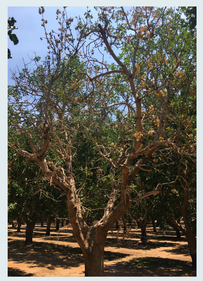
Death of a pistachio tree affected by Verticillium wilt