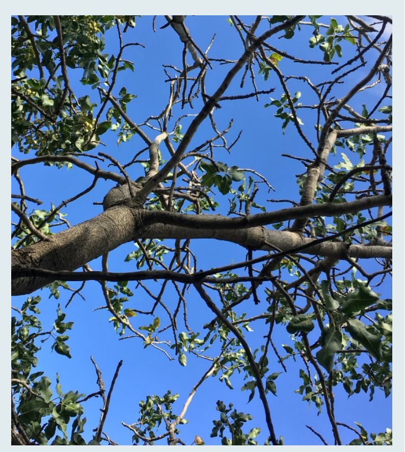
See-through canopy associated with thin leaf decline