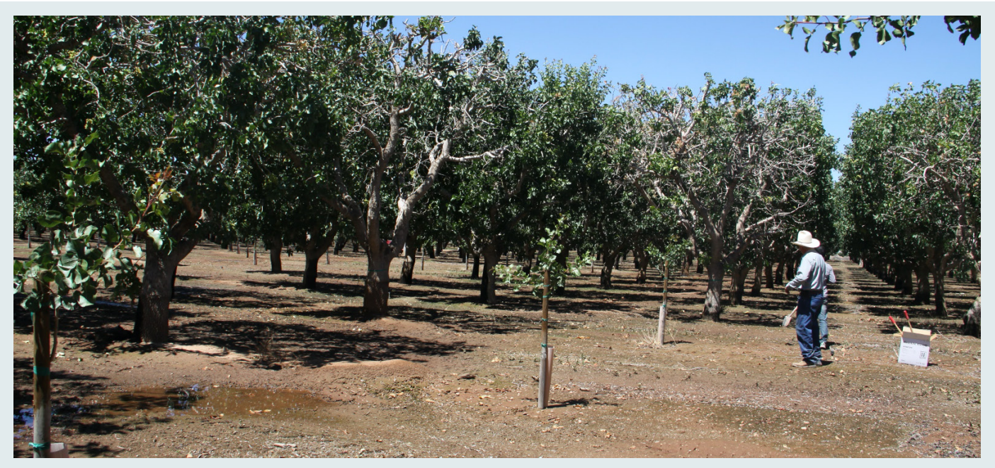
Lower areas of orchards with several tree fatality, trees located at the leading edge of infection continue to decline gradually (note dead trees in the center were replaced with young trees with resistance to Verticillium wilt )