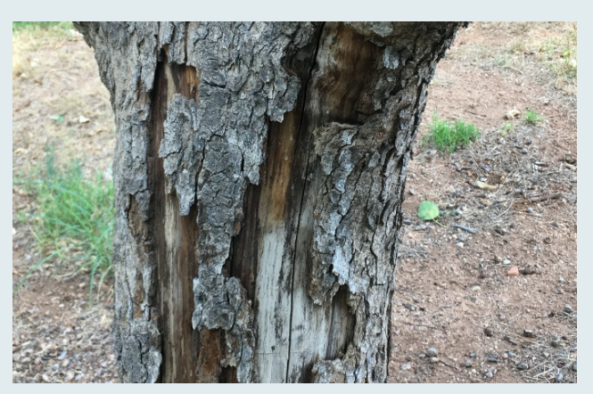
Bark crack or death on a tree with severe symptoms of Verticillium wilt