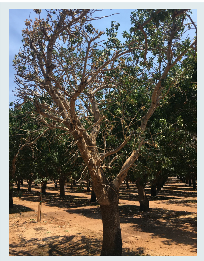
Rapid death of all but one scaffold branch