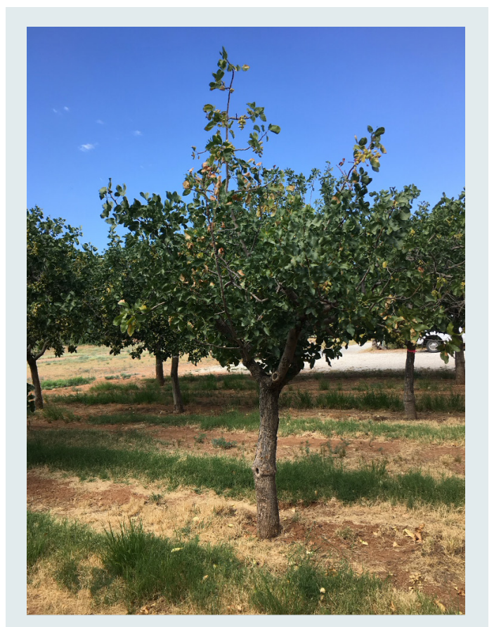
Leaf scorching on a pistachio tree affected by Verticillium wilt

The fungus survives as microsclerotia in the soil for many years, especially when previous soils have been planted with susceptible crops such as cotton, alfalfa, and cucurbits prior to orchard establishment. Microsclerotia germinate in the vicinity of actively growing roots and produce hyphae to infect roots. The fungus invades the xylem vessels of roots and leads to systemic infection of vascular system of the tree. Prolific fungal growth in the xylem channels restricts or disrupts the flow of water and nutrient. Disease development is favored by cold temperature, wet soil and stressed tree conditions. Hot summer may inactivate the fungus in aboveground portions and re-infections from roots may occur as favorable conditions return. Microsclerotia are produced in infected tree and returned