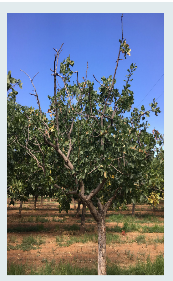
Slow twig dieback over several seasons