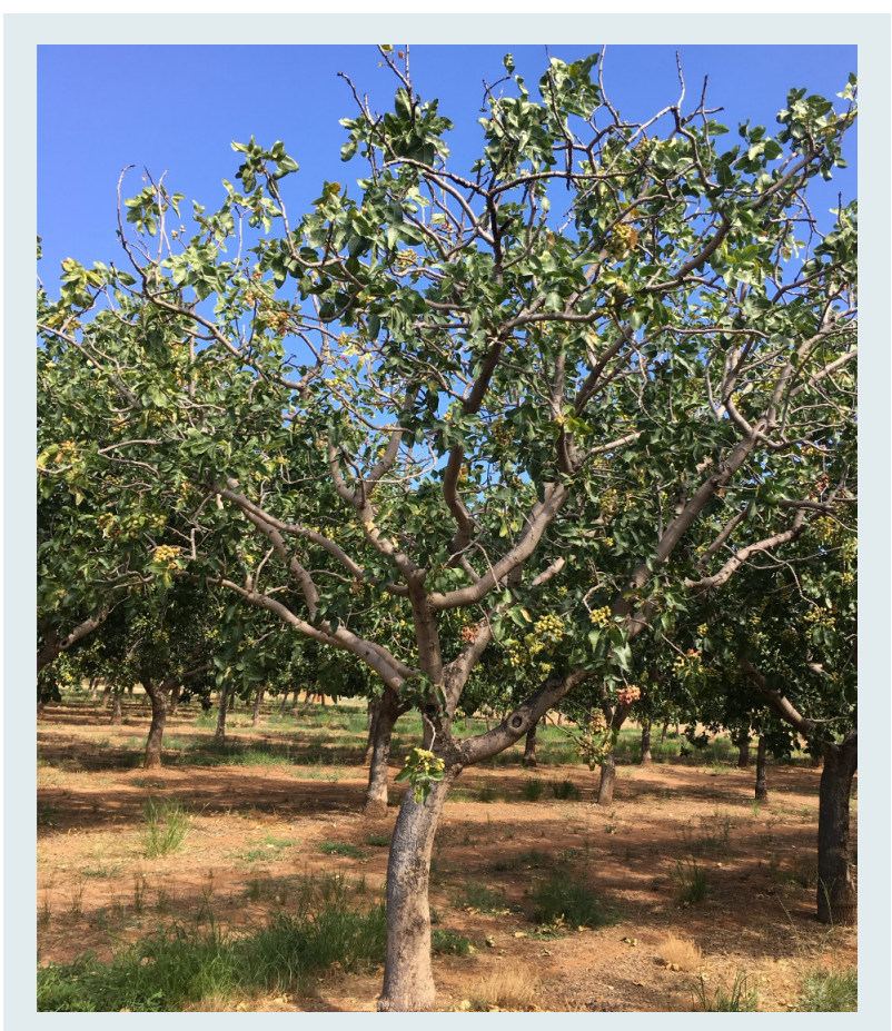
Thin leaf decline of a tree infected with Verticillium wilt