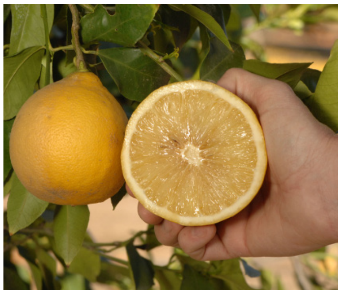
Figure 15. Bergamot sour orange hybrid.