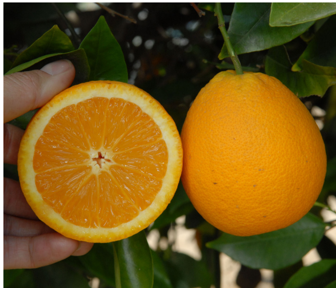
Figure 7. 'Delta Valencia' orange.

'Moro' (Fig. 9) is of Sicilian origin, but it is unclear exactly how it arrived in the United States 31 . The tree is moderately vigorous and spreading. The fruit is moderately-sized, round and borne in clusters. The peel is blushed red and slightly pebbly. When there is sufficient cold, the interior