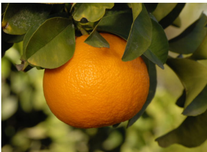
Figure 16. 'Bouquet de Fleurs' sour orange.

All oranges other than sour orange trees are grown on a rootstock. A rootstock is another citrus variety that the orange tree is grafted to in the nursery. Orange trees