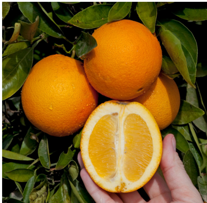
Figure 2. 'Parent Washington' Navel orange

This selection of navel orange is new to the United States but is well-known in Brazil where it originated