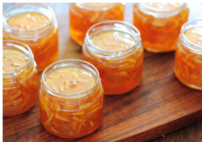
Figure 19. Orange marmalade.