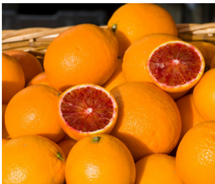
Figure 12. 'Tarocco' blood orange.