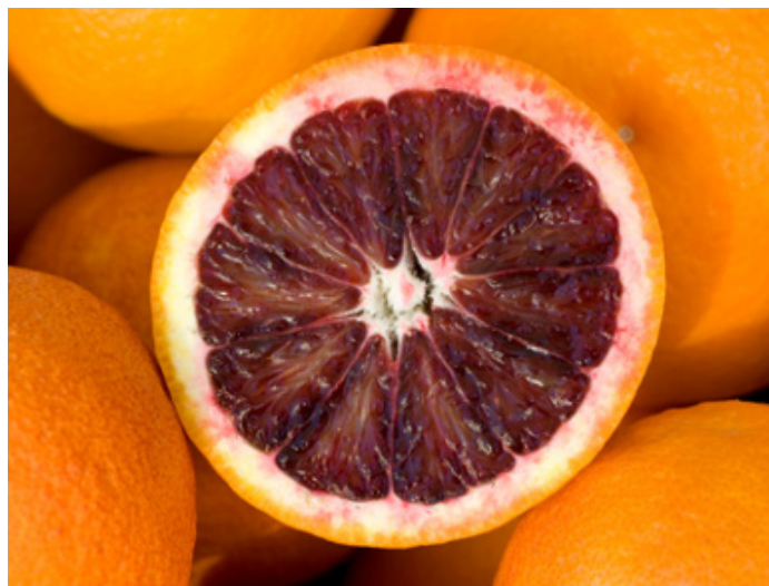
Figure 9. 'Moro' blood orange.