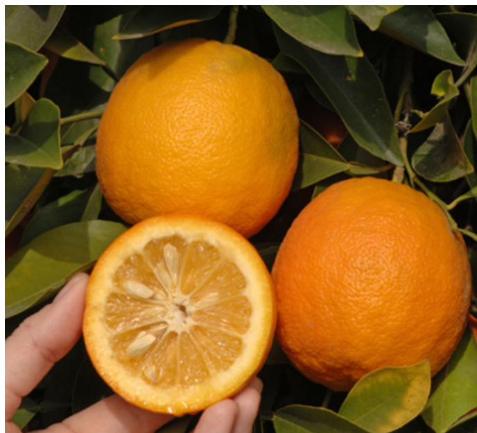
Figure 14. 'Seville' or standard sour orange.

Bergamot, Citrus x limon var. bergamia (Fig. 15) is likely a hybrid of a sour orange and a lemon 38,39 . First described in the 1750's it probably originated in Italy. The tree is small to medium size, spreading and thornless. Bergamot fruit is yellow, highly aromatic and has a smooth, thin peel. Fruit shape is generally round but with a slight neck. The flesh is pale yellow and sour. Bergamot oil is used in eau de cologne, and to flavor Earl Grey tea.