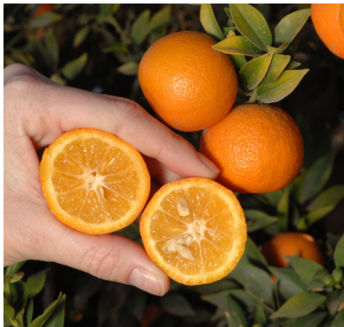
Figure 17. Chinotto orange.

are grafted to rootstocks because the rootstock generally improves growth, fruit quality or disease resistance of the tree. If you look carefully at the trunk, you will often see an area where the bark changes texture or where the trunk increases in circumference. Below that area is the rootstock and above it is the orange tree.