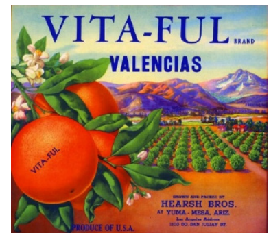
Figure 1. Early 1900's orange crate label from Arizona.

Navel oranges are favorites for eating fresh because they are usually seedless and relatively easy to peel. They can be juiced, but the juice should be consumed