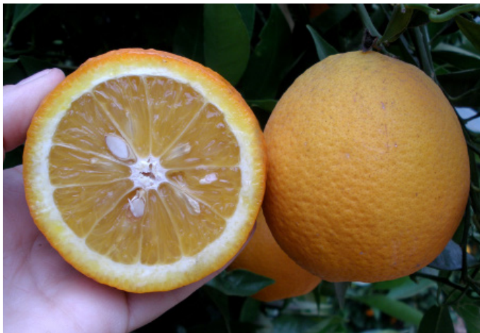
Figure 6. 'Pineapple' sweet orange.

pre-harvest fruit drop. Fruit that remain will ripen mid-season, from December until February, and for that reason, are susceptible to frost. Pineapple produces medium-sized oranges with fifteen to twenty-five seeds per fruit (Fig. 6). Juice content is high, with a fine, rich flavor and excellent color. Until recently, 'Pineapple' was the chief mid-season processing orange in Florida. The variety was named Pineapple because of the fragrance and flavor of the fruit.