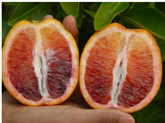
Figure 11. 'Smith Red' blood orange.