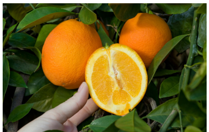
Figure 4. 'Fukumoto' navel orange.

This selection, like all the other navel oranges, originated as a spontaneous mutation of 'Washington'. 'Robertson'