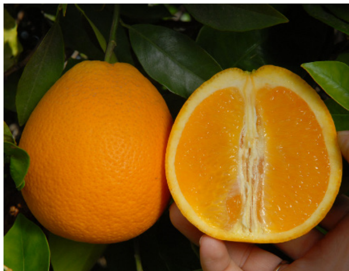
Figure 8. 'Midnight Valencia' orange.