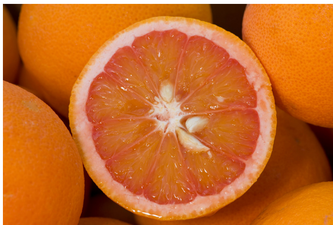
Figure 13. 'Vainiglia Sanguigno' acidless orange.