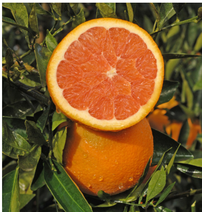
Figure 3. 'Cara Cara' navel orange.

'Fisher' originated as a naturally occurring mutation of 'Washington' 8 . This selection gained attention because it becomes sweet earlier than 'Washington', but it does not color earlier. Tree characteristics are similar to 'Washington'. In navel orange trials conducted at Yuma and Phoenix, 'Fisher' had the greatest yield.