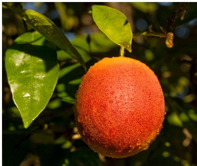
Figure 10. 'Sanguinelli' blood orange.

Acidless oranges are not well-known in the United States, but are quite popular in Europe, North Africa and Brazil. They have extremely low acid levels. The author