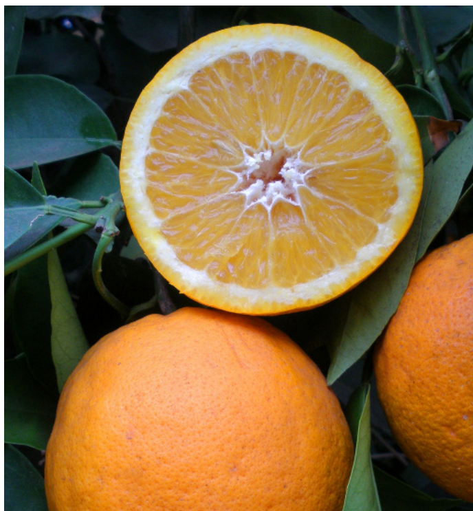
Figure 5. 'Hamlin' sweet orange.

This selection originated as a seedling in Florida in 1860, probably from fruit brought to Charleston, South Carolina from China 18 . 'Pineapple' orange trees are medium to large-sized and very productive, although they tend to bear in alternate years. 'Pineapple' trees are also susceptible to