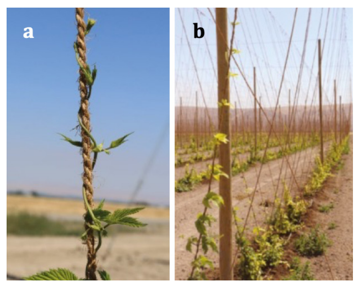
Figure 4: Bine stringing and training