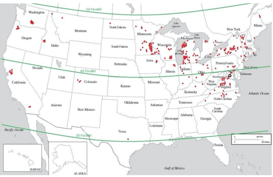
Figure 1: Hop growing region in the United States of America (Sara del Moro, 2015 \mbox{$\bigcirc$} John I. Haas, Inc)