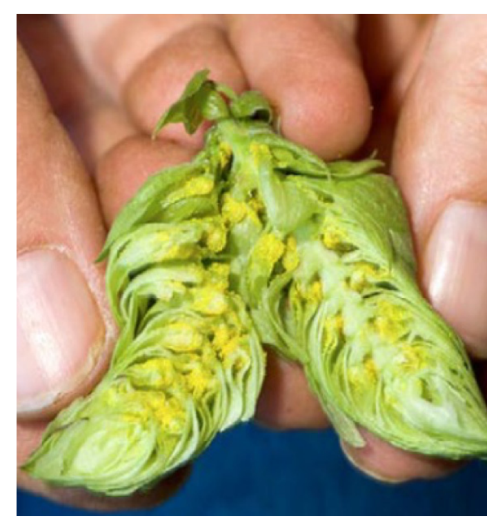
Figure 5: A matured hop cone with golden-yellow colored lupulin inside.

At the beginning of each growing season, select the three to six healthy bines from the hill of each plant and remove all