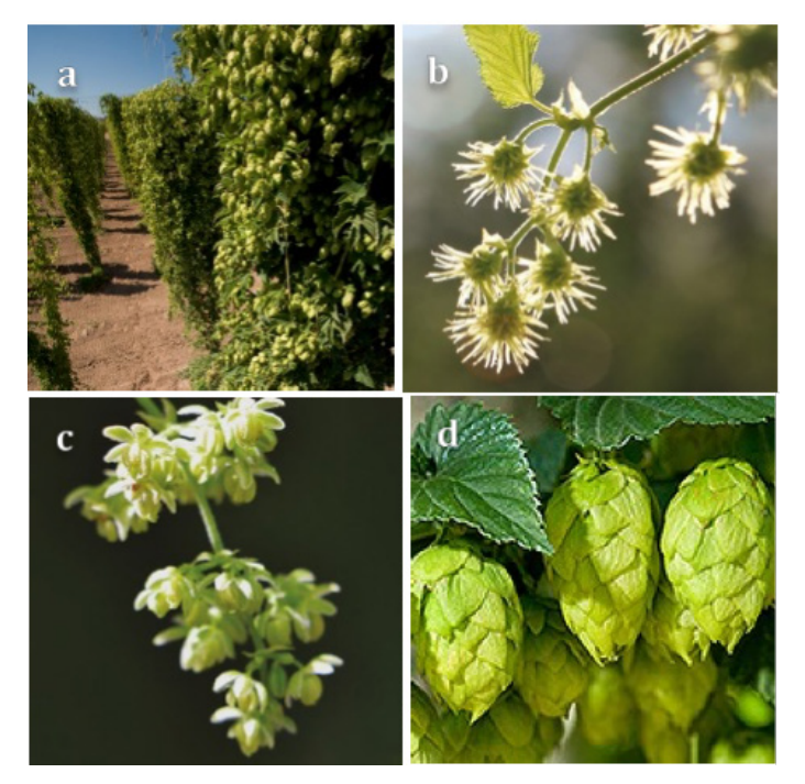
Figure 2: Hop plant (a), female hop flower (b), male hop flowers (c), and a vertically cut mature hop cone with Lupulin glands (d) (Pictures b and c by Dodds 2017 ©NSW Department of Primary Industries; Pictures a and d by Stephen Ausmus, © USDA).

is important to know that hop is a dioecious plant, which means seeds could germinate into a female or male plant and will produce a female (Figure 2b) or male (Figure 2c) flowers, respectively. The male flower is a pollinator while the female produces the cone-shape (hop) (Figure 2 d) with the economic value. Though the male serves as a pollinator, the female can still produce the hop cones without the male (Conway and Snyder 2008).