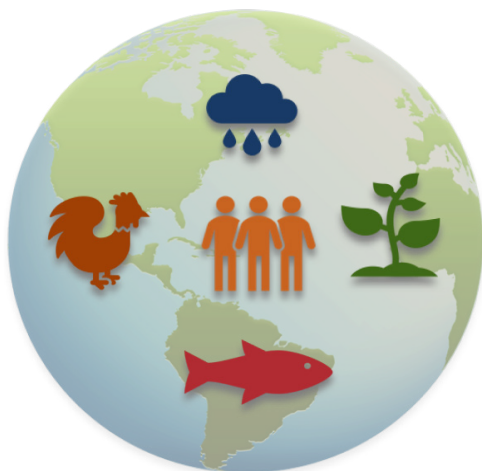
Fig 2. PFAS are found in all environments and across the globe.

Because they are so stable, resistant to degradation, and migrate easily, PFAS are ubiquitous (found everywhere) throughout the world. Water, soil, plants, animals, and people in both urban and remote locations have been found to contain trace levels of PFAS (ASTSWMO, 2015). PFAS have also been detected in indoor and outdoor dust and even in the atmosphere (Trudel et al., 2008; Mitro et al., 2016). PFAS are found at particularly elevated levels in areas where firefighting foams have been used or stored, such as military installations, aircraft crash sites, and airport hangars. Although PFAS have been found in tissue and blood samples from humans and animals worldwide, there is good news: the overall levels of PFOA and PFOS, in both the environment and in people, are on the decline. This is largely due to the U.S. no longer manufacturing PFOS and reducing its PFOA production, which will soon be phased out entirely (NIH, 2016; EPA, 2018)