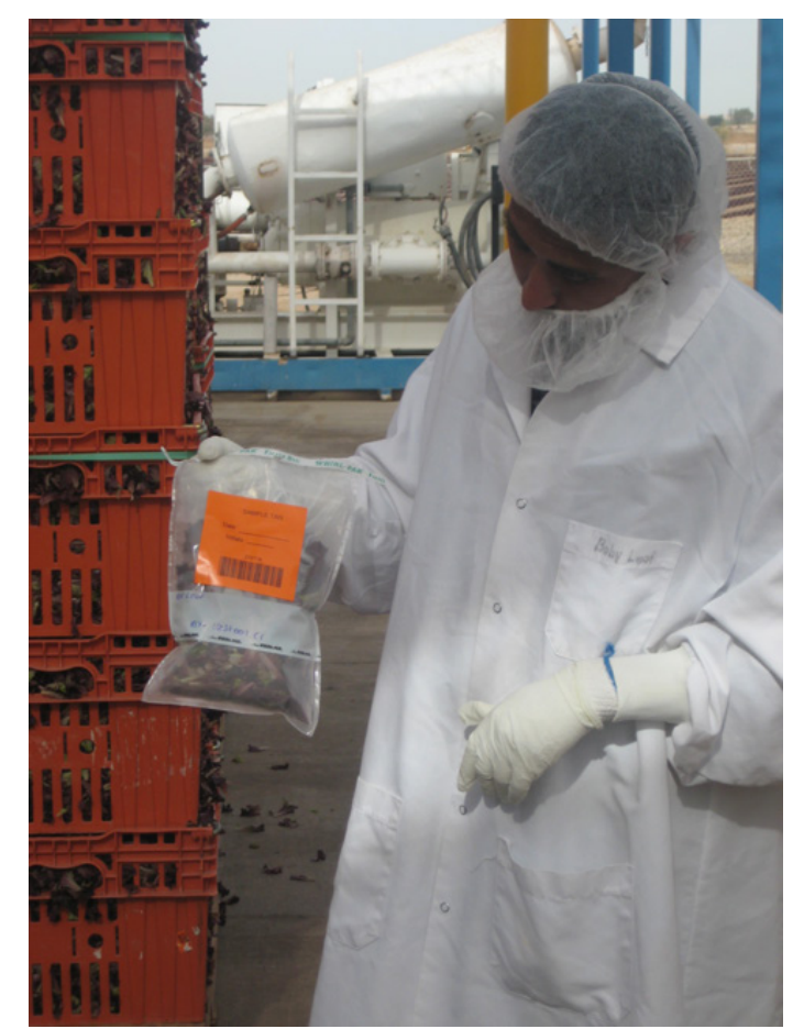
Figure 2. Raw Product Testing for E. coli bacteria

Because contaminated water poses such a large threat to human health, water managers and regulatory agencies utilize tests to tell us if our water is safe for its intended use. As mentioned above, E. coli is commonly used to indicate that fecal contamination is present in water. Although, we do not want to find E. coli in our water, these bacteria can be easily quantified using simple methods. The E. coli are generally reported in colony forming units (CFUs), with one CFU equal to a single, viable bacterium that is capable of causing infection. Detection