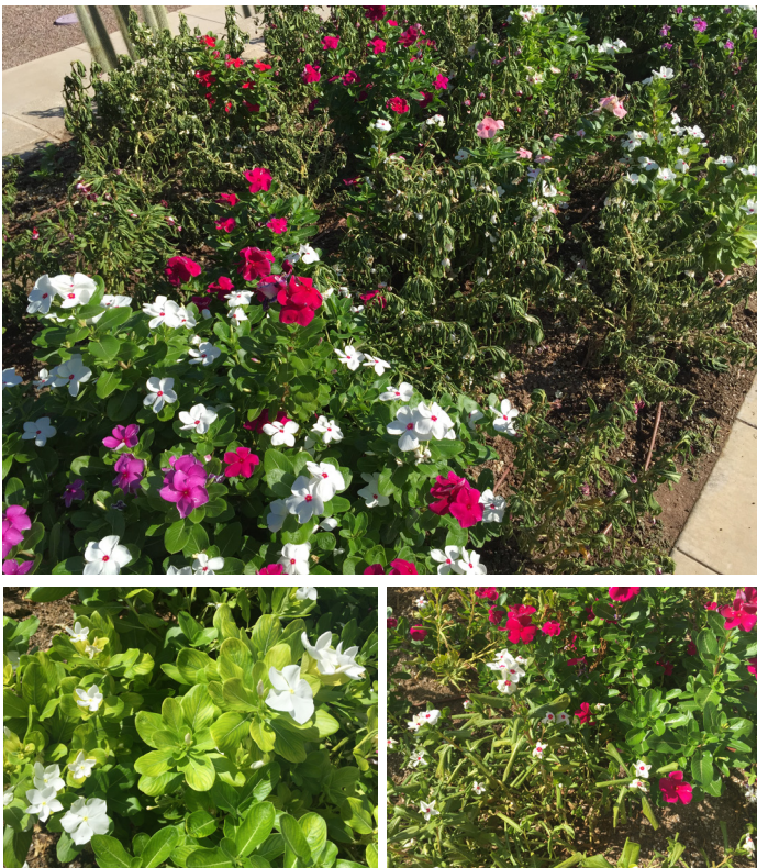
Fig. 1. Vinca showing symptoms of drying plants right next to healthy plants (top), severe chlorosis (lower left), and wilting (lower right). Close up inspection of shoots and roots and possibly laboratory analysis are necessary to identify the cause and implement control treatments.

Annual bedding plants create instant impact with long blooming flowers or colorful foliage. In the desert Southwest, bedding plants are installed twice each year: cool season bedding plants are planted at the beginning of fall and warm season plants at the beginning of spring. Installing new plants twice a year is a considerable investment of time and money. To protect this investment, regular inspections and care are necessary to maintain healthy plants. Regular maintenance tasks include removing weeds and debris, irrigation and fertilization, pruning shoots, and removing spent flowers. Inspection or maintenance frequency can vary from a few days