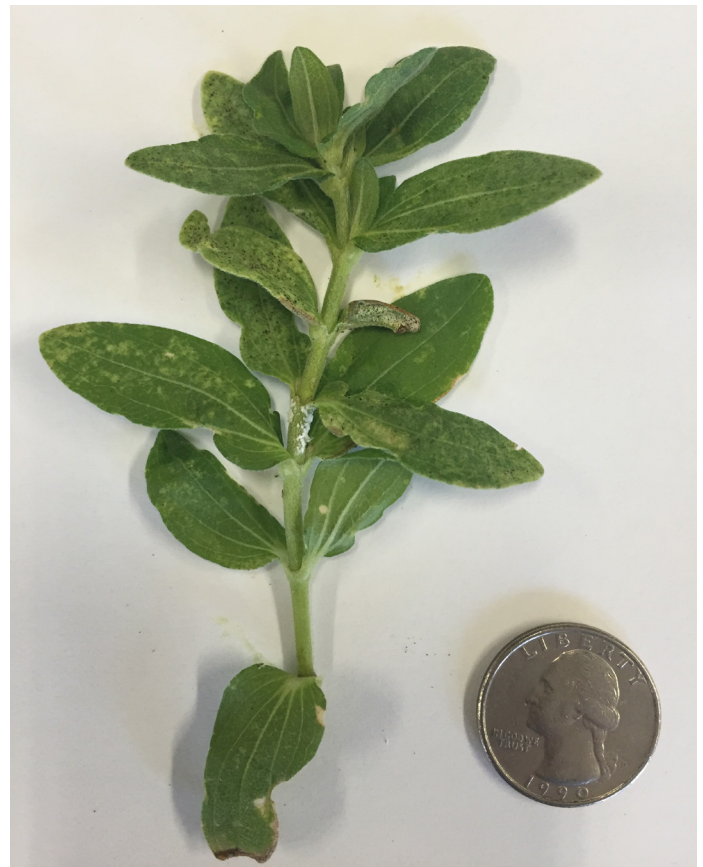
Fig. 2. Zinnia with symptoms of insect infestation and disease.

Annual bedding plants create instant impact with long blooming flowers or colorful foliage. In the desert Southwest, bedding plants are installed twice each year: cool season bedding plants are planted at the beginning of fall and warm season plants at the beginning of spring. Installing new plants twice a year is a considerable investment of time and money. To protect this investment, regular inspections and care are necessary to maintain healthy plants. Regular maintenance tasks include removing weeds and debris, irrigation and fertilization, pruning shoots, and removing spent flowers. Inspection or maintenance frequency can vary from a few days