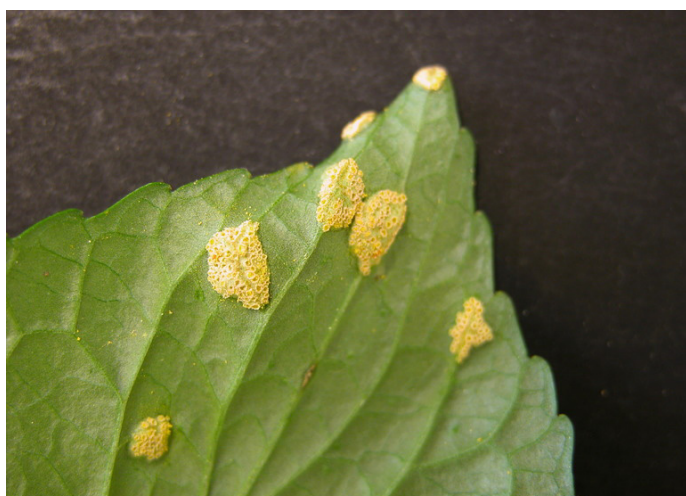
Fig. 6. Symptoms of powdery mildew (top) and rust (bottom).