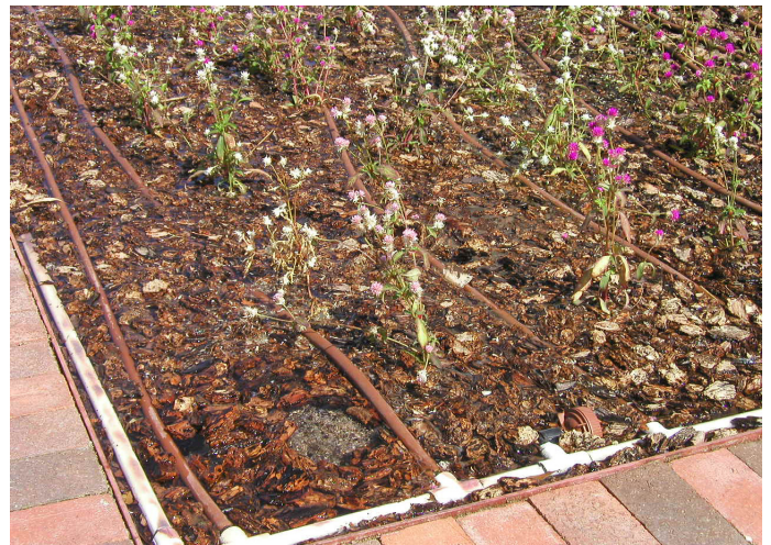
Fig. 3. Overwatering and poor drainage caused the decline of globe amaranth. Symptoms can also be caused by root diseases.

trees, a covered patio or can be covered temporarily. Flower beds in the open can be covered with frost cloth until the danger of freezing temperatures has passed. Proper watering will minimize damage to plants due to wind and heat by supplying moisture to continue transpiration and photosynthesis when demand for water is high.