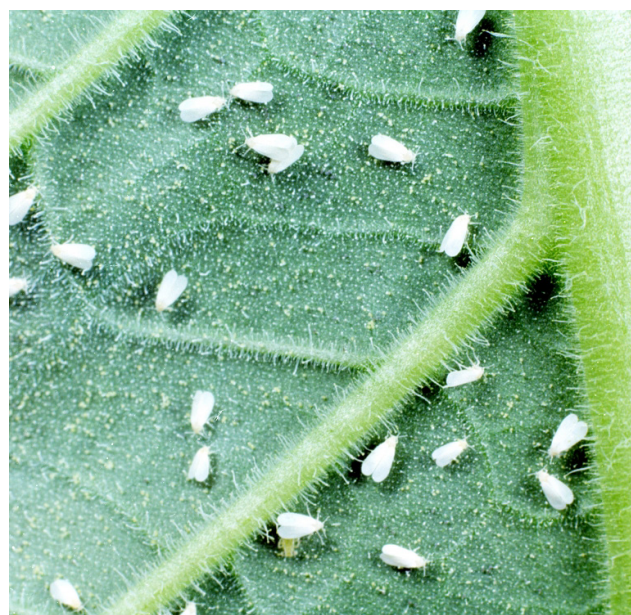
Fig. 7. Aphids (top) and adult whiteflies (bottom) feed on leaves and stems.

are susceptible to rust. Rust infects plants under moist conditions. Keeping plant foliage dry and promoting good air circulation can reduce infection. Fungicides and neem oil can be used to control rust. It is best to plant resistant species or cultivars whenever possible.