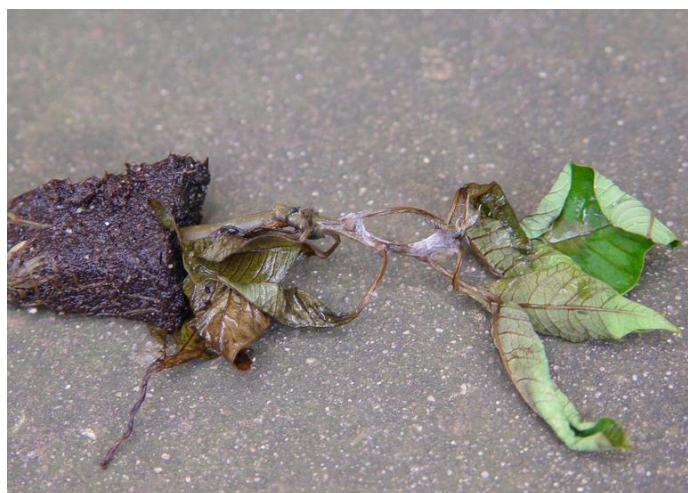
Fig. 5. Rhizoctonia (top) and Pythium (bottom) fungi caused root and stem rot.

plants such as petunia, vinca, verbena, snapdragon, stock and others. Symptoms include rotting tissue at or below the soil line followed by wilting and plant death (Fig. 5). Healthy roots are light brown and root tips are white while infected roots turn brown or black with the outer layer easily pulled off. Very young plants are susceptible to damping off; that is seedlings fall over because the fungus damaged the stem tissue at soil level or the roots. Above ground parts are wilted with yellow leaves and stunted growth. Fungal root diseases are favored by overwatering, high temperatures, and soils with high clay content and poor drainage. Soil preparation before planting can improve drainage and prevent severe fungal root problems. Fungicides can be used once the disease causing organisms are identified. Diseased plants should be removed as soon as possible to prevent further spread. Bedding plants benefit when the top layer of the soil is replaced every couple of years to prevent a buildup of disease organisms.