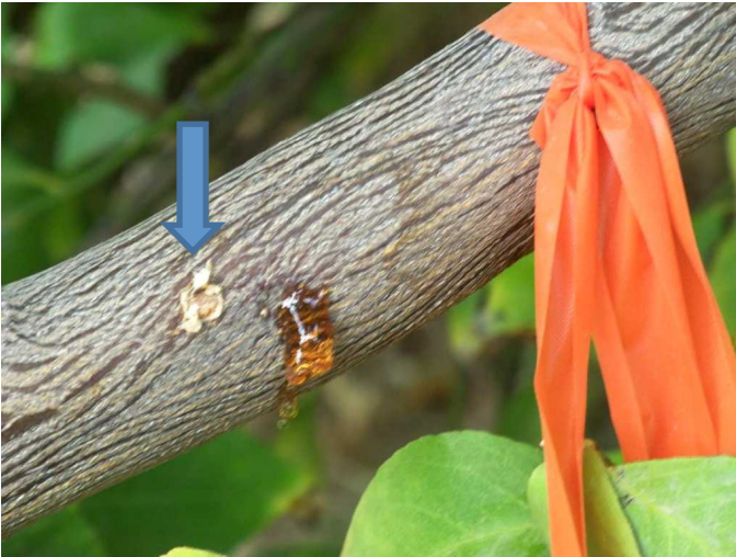
Figure 5. Dowel inserted in branch