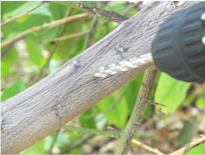
Figure 3. Drilling the hole for the dowel.