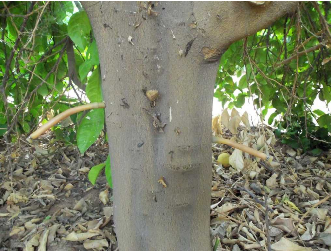
Figure 7. Pouches after 24 hours