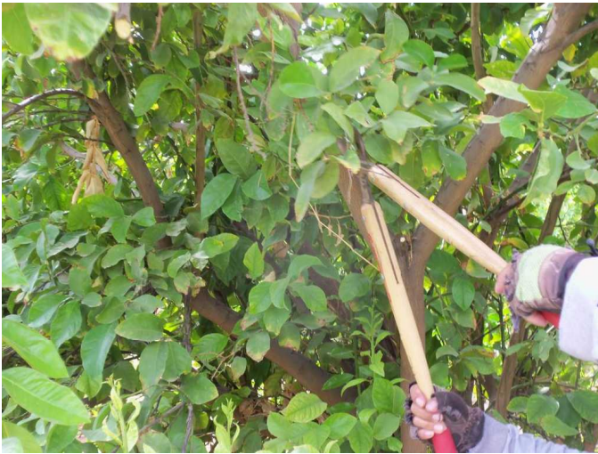
Figure 2. Removing branches prior to insertion of dowel.