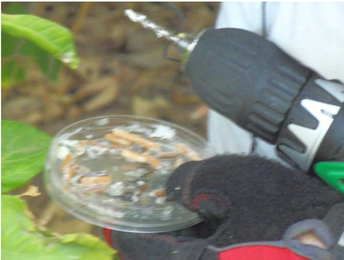
Figure 4. Petrie plate with dowels.