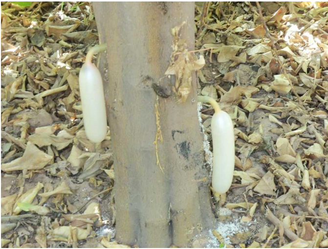
Figure 6. Trunk with pouches attached