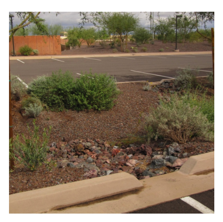
Figure 2. Curb cuts in a parking lot passively harvest rainwater by diverting it into a swale where native vegetation can take advantage of the supplemental water.