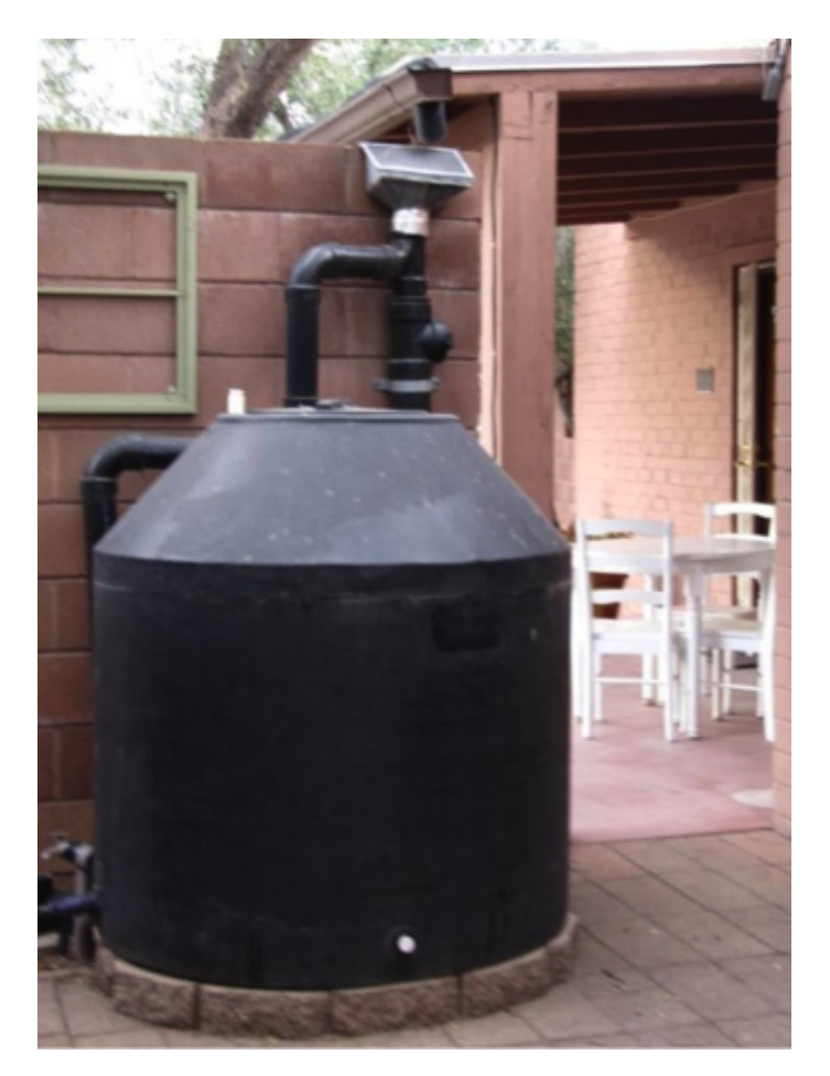
Figure 1. A cistern is placed under a gutter, where it collects rainwater from the roof. The screen and first flush device capture debris and pollutants.