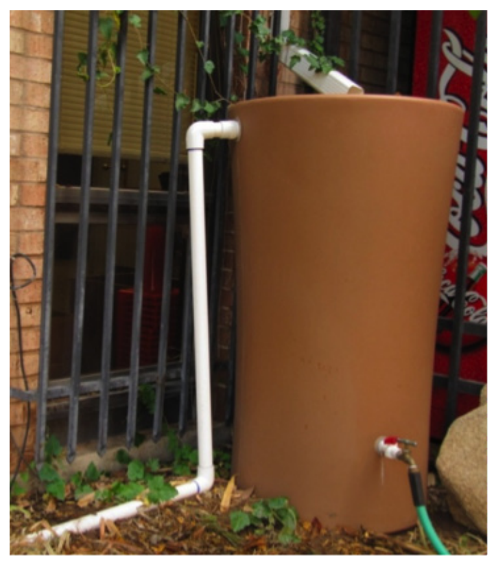
Figure 3.The overflow pipe—made with PVC (or ABS) material found at your local hardware store—takes water away from the cistern and the foundation of the building in the event that the cistern fills to capacity.