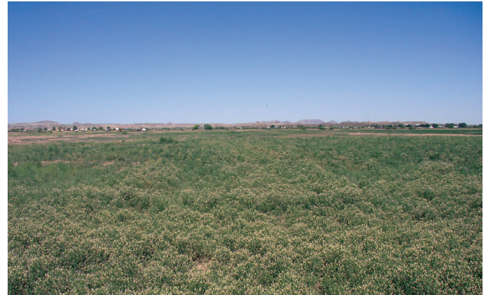
Figure 2. Russian knapweed ( Acroptilon repens ) has taken over this area and out-competes native vegetation.

invasive plants become established, they can completely replace the existing native vegetation (Figure 2). In so doing, they: