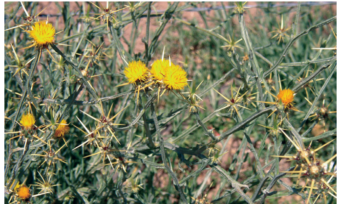
Figure 1. A single plant of yellow starthistle ( Centaurea solstitialis ) can produce up to 150,000 seeds under favorable conditions.

In Arizona, invasive and noxious plants have a significant impact on native vegetation and ecosystem health. Because invasive plants are competitive against native plants, once