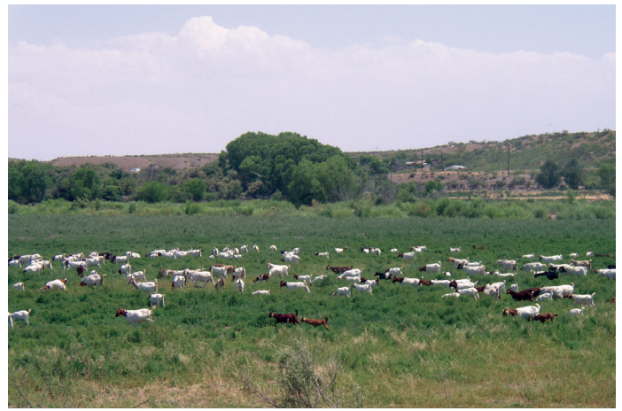
Figure 4. Goat grazing, in combination with other control methods, can be effective for reducing some invasive weed infestations.

Mechanical control includes activities such as mowing, hoeing, and hand pulling. Mow weeds before they go to seed. Repeated mowing in the same year may be necessary. Pull small weed patches and weeds near streams by hand.