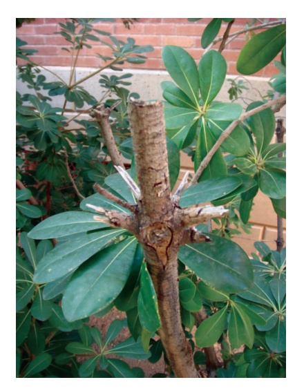
Figure 2. A heading cut removes part of a branch resulting in multiple new shoots below the cut (left and middle). Leaving stubs should be avoided (right) as they will usually die back.

Heading cuts remove parts of a stem or branch resulting in multiple new shoots just below the cut (Figure 2). This can create a bushy plant and is sometimes done when plants are very young to stimulate more branches. However, repeated heading is similar to shearing and eventually results in a dense canopy with branches having leaves at the tip and no leaves further back. Heading cuts should only be used for formal hedges, for rejuvenation, or when a cluster of branches is desired. Stubs left by heading cuts will usually die back, unless cut just above a bud.