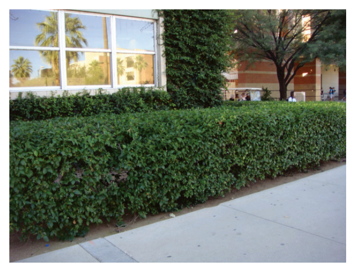
Figure 6. Japanese or waxleaf privet (left) and xylosma (right) tolerate shearing and are appropriate for formal hedges.