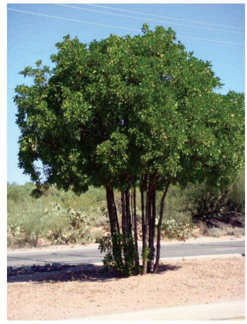
Figure 10. Texas mountain laurel is a slow growing shrub that can be trained into a small multi-trunk tree.