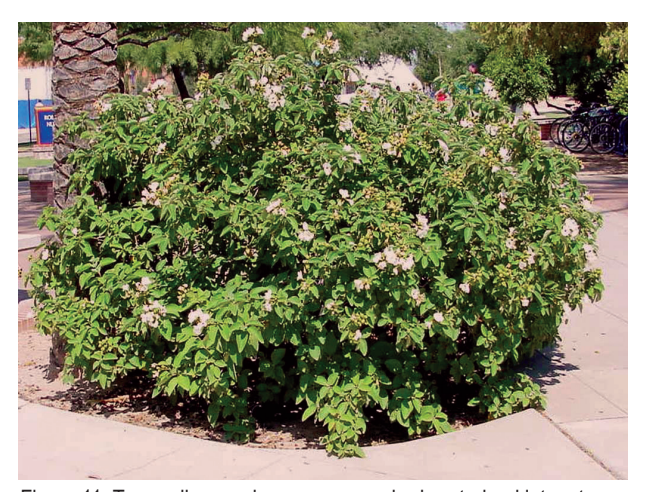
Figure 11. Texas olive can be grown as a shrub or trained into a tree.