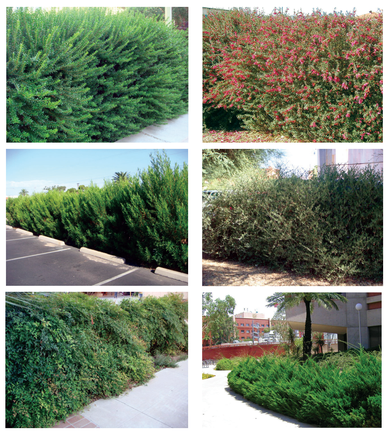
Figure 7. Myrtle (top left), emu bush (top right), hop bush (middle left), jojoba (middle right), heavenly bamboo (lower left) and juniper (lower right) form informal hedges with little maintenance when given enough room to grow to their mature size. Myrtle and jojoba can also be sheared.

inches at a time, otherwise leafless branches may become visible. Maintenance of established hedges usually starts after spring growth is completed. Follow up depends on the species and the level of formality desired. Old, overgrown hedges can be rejuvenated, as discussed before, provided the shrubs respond well to severe cutback. Formal hedges are time consuming to maintain compared to informal hedges, which are allowed to grow in their natural form and need very little maintenance.