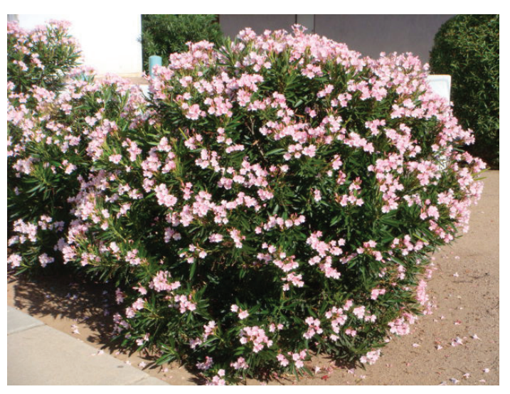
Figure 4. Oleander is not well suited for shearing (left). Repeated shearing removes flower buds and flowers, leads to loss of leaves in the canopy and a thin layer of leaves on top. Kept in its natural shape an oleander shrub will flower from spring to fall (right).