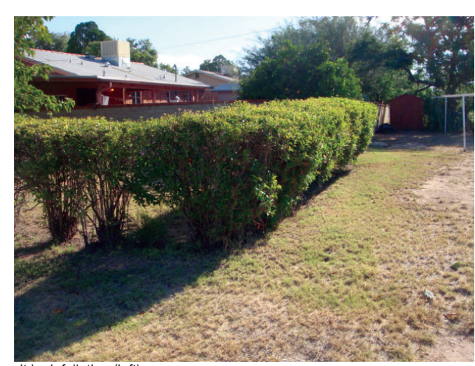
Figure 8. The top of hedges should not be wider than the bottom, which will result in defoliation (left).