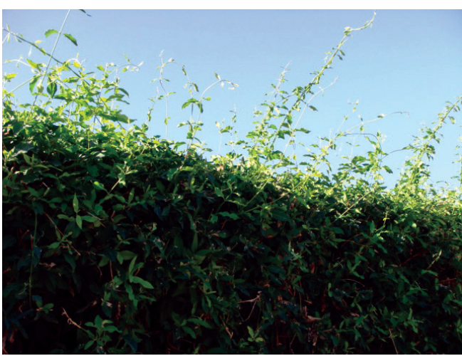
Figure 9. Branches extending the top of a formal hedge are ready to be cut when they extend up to one foot above the desired shape of the hedge.