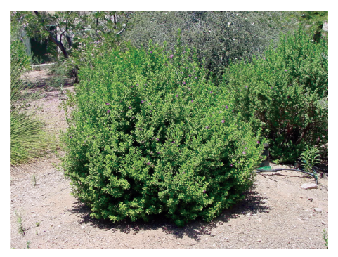
Figure 3. Rejuvenating shrubs that are overgrown starts by cutting them at 12-18 inches above the ground in late winter or early spring. By fall the shrub has grown a full new canopy.