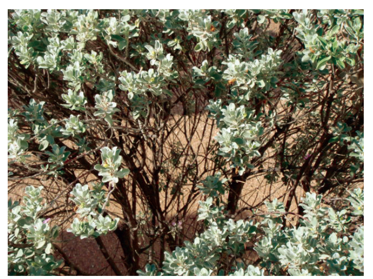
Figure 5. Repeat shearing of Texas ranger stresses the plant and results in a thin layer of leaves on the outer part of the canopy, giving the shrub a transparent appearance.