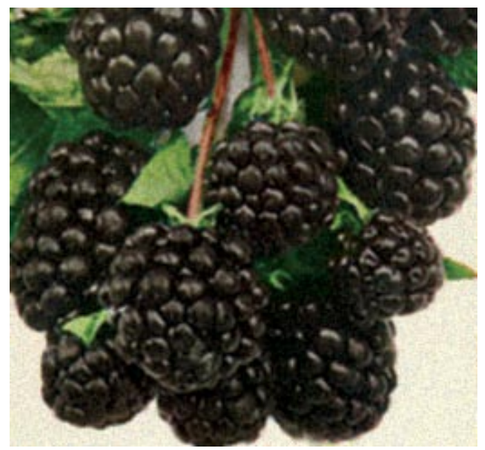
Figure 1. Rosborough blackberry

Blackberry canes are biennial. Canes are fruitless the first year, bear fruit the second year, and die after fruiting. In June following harvest, all fruiting canes (floricanes) should be removed, leaving only the leafy vegetative or primacanes (see figure 2). New primacanes produced in the second and