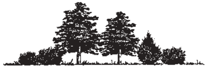
Figure 2: Ladder fuels enable fire to travel from the ground surface into shrubs and then into the tree canopy.

Mow grasses low around shrubs. Prune dead stems from shrubs annually. Remove the lower branches and sucker sprouts from trees to raise the canopy away from the ground.