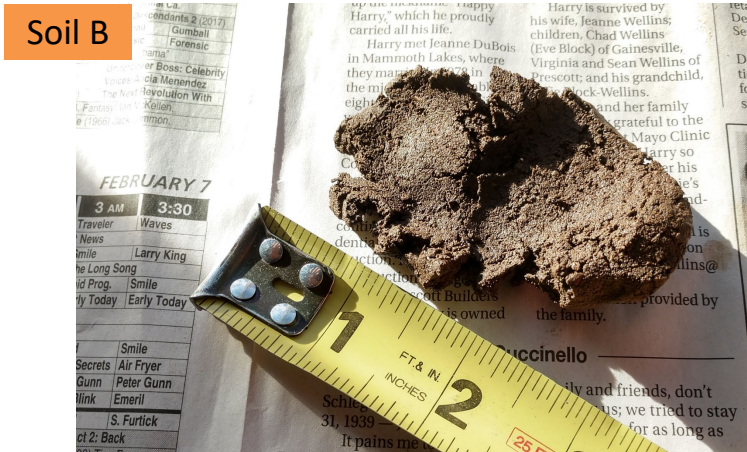
This ribbon is between 1" and 2" long

Second Step: Does moist soil form a ribbon and if so, how long is it?