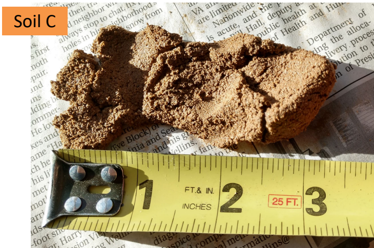
This ribbon is longer than 2"

Second Step: Does moist soil form a ribbon and if so, how long is it?