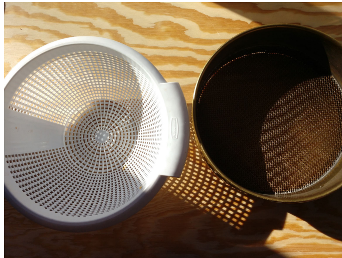
Kitchen Colander and 2mm Soil Sieve