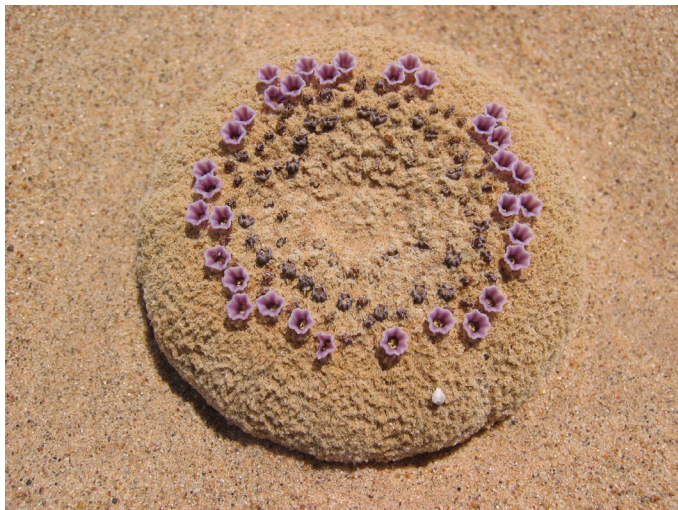
Pholisma sonoreae

You can find the original article at: http://blogs.extension.org/gardenprofessors/2015/03/24/garden-site-selection/