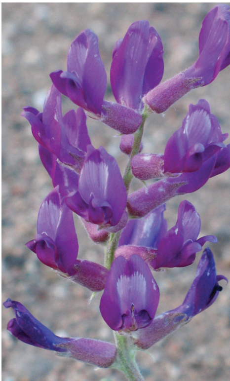
Astragalus species? (locoweed)