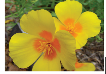
Mexican Gold Poppy

found in the Sonoran desert. The Mexican gold poppy is more yellow in color and is two toned with the center being a darker orange and has no rim or an inconspicuous rim under the flower. California poppies are more orange