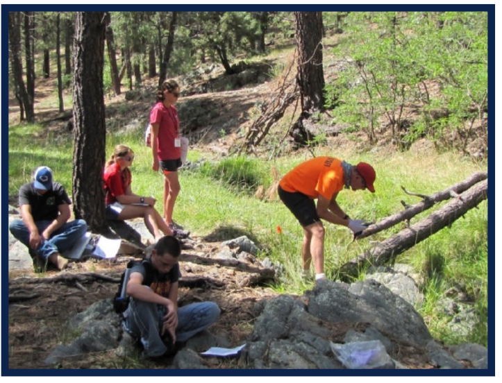
Campers describing the flora and fauna near Ash Creek at the James 4-H Camp at Mingus Springs.