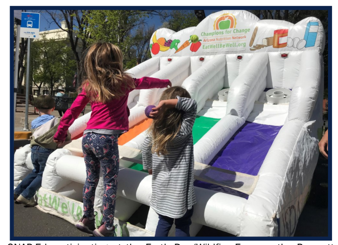
\ensuremath{\mathsf{SNAP\text{-}Ed}} participating at the Earth Day/Wildfire Expo on the Prescott Courthouse Square.