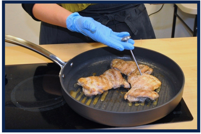
Checking the interior temperature of chicken during a food safety demonstration.

evaluation, participants had a 36% average increase in knowledge about food safety practices.