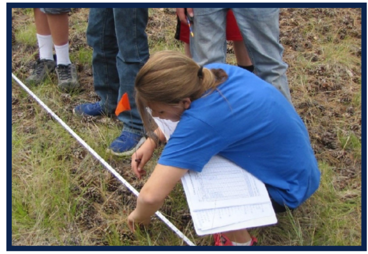
The James 4-H Camp at Mingus Springs provides campers with hands-on field and data collection experiences.