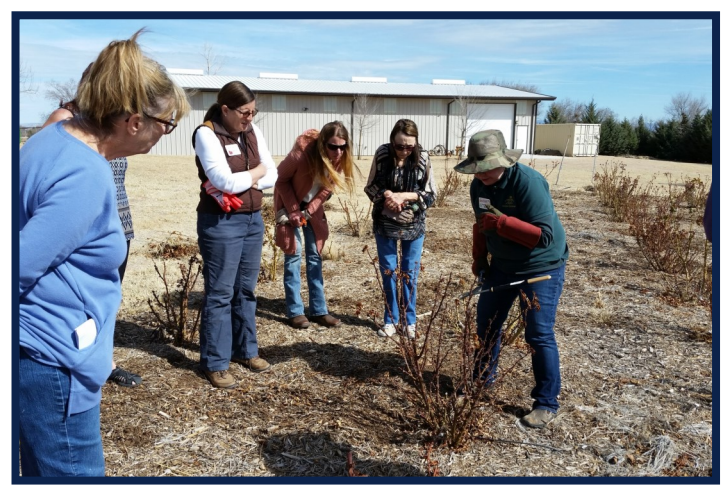
Master Gardeners attending a Rose Pruning Workshop in Chino Valley, AZ

In 2018, 181 Master Gardeners contributed 14,887 hours of volunteer service to citizens and institutions of Yavapai County. This was accomplished through direct outreach at public events, Speakers' Bureau presentations, and the Master Gardener Help Desks in our Camp Verde and Prescott offices. Educational contacts included 4,082 faceto-face, 797 phone, and 387 e-mail contacts. Master Gardeners also provided on-site assistance and education to three community gardens, four school gardens, two museums, a hospital, and a zoo. Master Gardeners also staffed ten educational displays at public events, gave 58 presentations, and two Osher Lifelong Learning Institute (OLLI) classes that reached 1,168 residents. Master Gardeners partnered with the SNAP-Ed program efforts to create raised beds, install irrigation systems, and design outdoor learning spaces at schools and Head Start Centers. They also installed landscape/irrigation at the Camp Verde Extension Office and partnered with the Highlands Center for Natural History to provide instructional assistance in school habitats. The annual July Monsoon Madness Plant and Yard Sale provided an opportunity for Yavapai County residents to purchase and learn about using