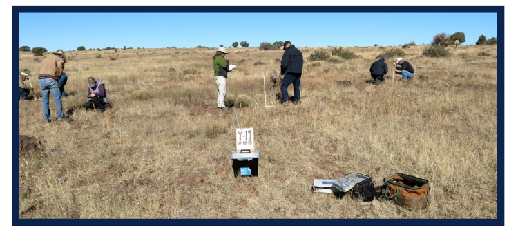
Coordinated Resource Management Team monitoring rangeland trend at the Yavapai Ranch.

Livestock nutrition is an important consideration for Yavapai County ranchers. Forage quality decreases during the winter months and cattle are usually provided with supplemental protein and energy. This supplementation provides mother cows with the nutrition to recover from calving, feed their calf, and get rebred the following cycle. A Livestock Nutrition Workshop was presented by University of Arizona faculty and other experts in Prescott on March 7 and attended by 43 ranchers.