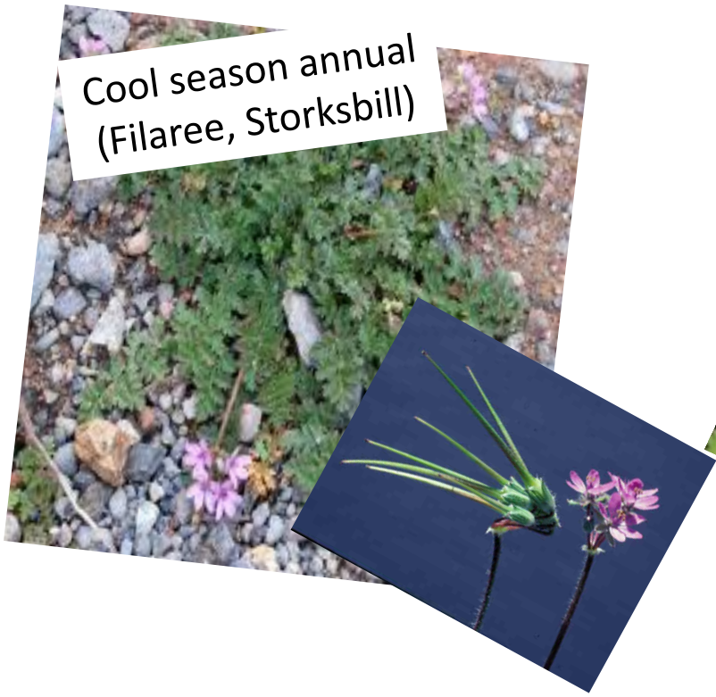
Cool season annual (Filaree, Storksbill)