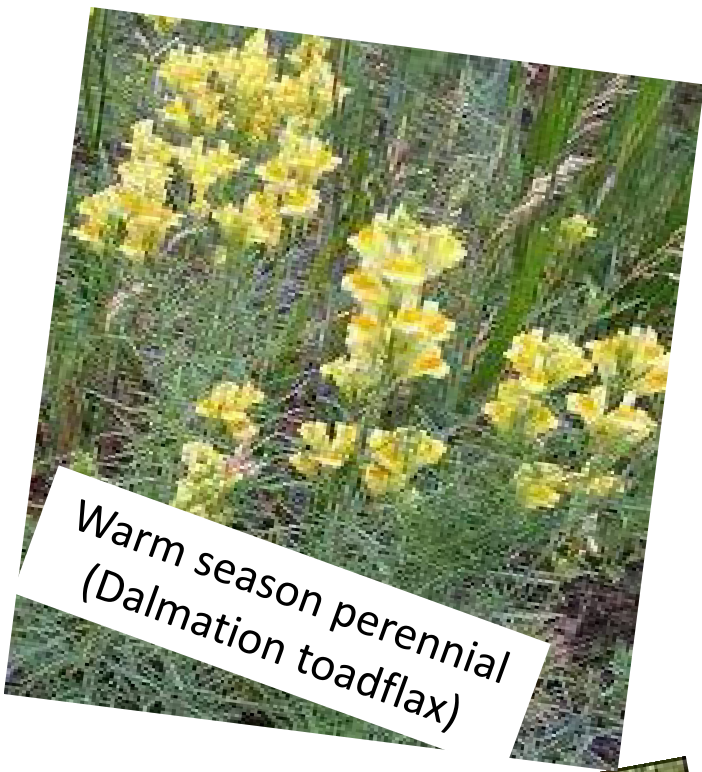
Warm season perennial (Dalmatian toadflax)