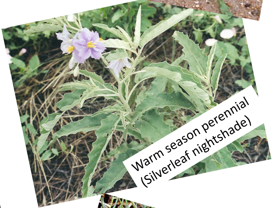
Warm season perennial (Silverleaf nightshade)