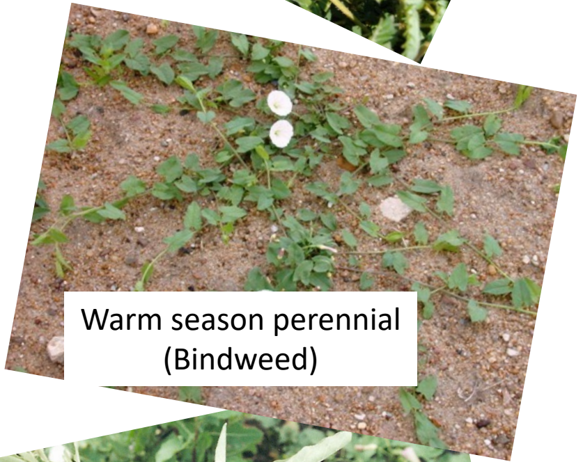
Warm season perennial (Bindweed)