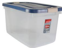
Supply Tote (reference materials, etc.)