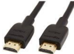
HDMI cable to connect laptop to TV