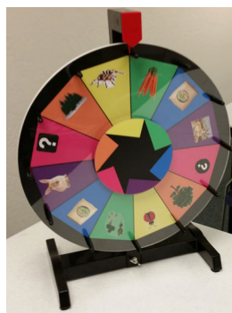
Wheel of Questions