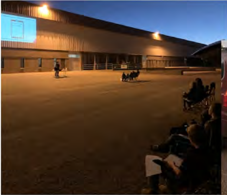
Drive-in YQCA Class