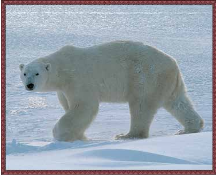
Tom J. Ulrich

AS their name implies, polar bear are native to the polar region of Europe, Asia and North America. They are found on ice fields or on land along the arctic coastline. Polar bear are good swimmers and at times are found many miles from land or the ice fields. When swimming, they use just their front legs, letting their hind legs extend behind their body as a rudder. The average weight of the polar bear is about 1000 pounds. Large males may reach 1600 pounds in weight.