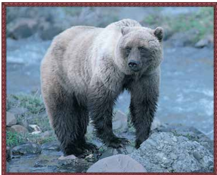
Tom J. Ulrich

A T one time the grizzly and brown bear were considered separate species. Recent studies indicate they are the same species, but continue to be commonly identified as either brown or grizzly bear. The range of the brown bear is along the Pacific Coast of Alaska and Canada. Grizzly bear are found in the mountainous interior of Western North America. Their range has decreased in size since the coming of the white man and at the present time there are only limited numbers in the mountain areas of western North America, with the majority being in Alaska and Canada. Adult males will weigh from 800 to 1200 pounds. The females are smaller. As with the black bear,