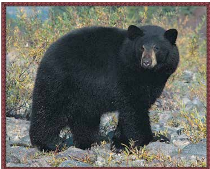
Tom J. Ulrich

B LACK bear are residents of the woodlands in much of North America. Their color is not always as their name implies. It may be a variety of different shades of brown, cinnamon or black. They have good senses of smell and hearing, but rather poor sight. The size of the adult bruin varies from 200 to over 600 pounds. Being omnivorous, their diet consists mainly of grasses, berries, insects and both fresh and decayed meat. Large quantities of food are eaten during the summer and fall, until a thick layer of fat develops. This