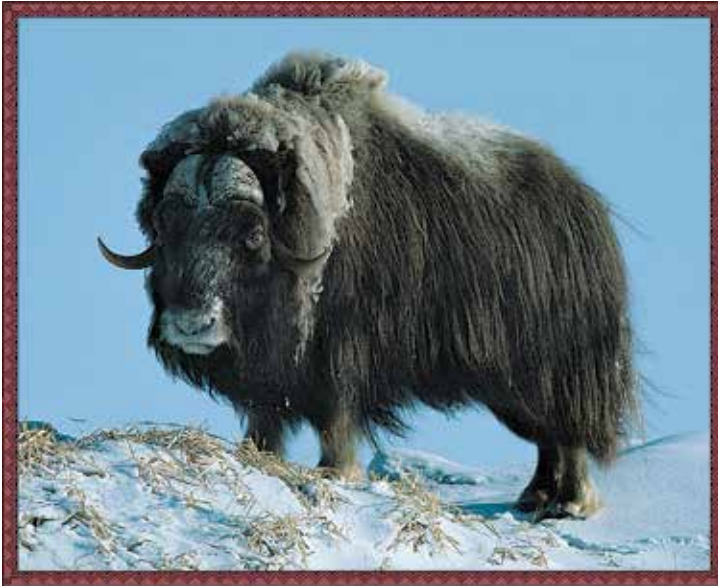
Tom J. Ulrich

T HE arctic tundra of North America is the range of the musk oxen. They are well adapted to this extremely cold and dry climate that has little rainfall and only about 10 to 30 inches of snow each winter. The snow becomes drifted in ravines and on hillsides, leaving some areas almost free from snow. The musk oxen feed on various grasses, shrubs and lichens that are found in these areas. Their hearing is good and they have exceptional eyesight that is subjected to a variety of changing lights. They are able to see during the darkness of the winter months, the constant daylight of the summer months, and with the glare on the snow in spring. Both bulls and cows have horns. Their hair consists of a short, dense undercoat and a long, coarse outer coat. The longer hair may reach a length of two or three feet. They have small tails and short ears that are hard to see due to the long hair.