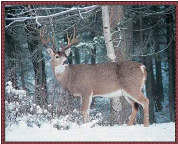
Tom J. Ulrich

W HITE-TAILED deer are the most common big game animal in North America. They are found in a wide variety of brushy or forested habitats. As their name implies, the white-tailed deer have white hair on the under side of their tail. When the animal runs and bounds, the tail is carried up and the white hair appears as a flag which can be seen at long distances. Whitetails have good senses of smell, hearing and sight that they rely on for detecting danger in the brushy habitats in which they live. The weight of the adult bucks varies from 125 pounds to more than 350 pounds and does weigh from about 100 to 150 pounds. The Key deer of Florida and the deer in Central America may weigh no more than 50 to 80 pounds as adults.