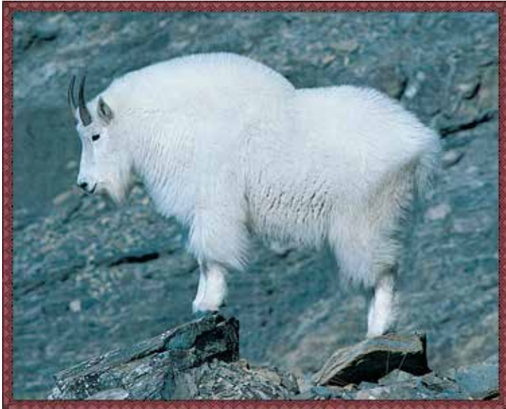
Tom J. Ulrich

M OUNTAIN goats are native to the high mountain slopes of northwestern North America. They have been successfully transplanted to mountain areas of other states. When in danger, the mountain goats rely on their sure footedness rather than speed and will climb steep and almost impassable places to escape predators. The shape of their hooves is the reason for their ability to climb the steep mountain sides. The bottom of the hoof has a pad that protrudes beyond the edge of the hoof, forming a convex surface that prevents the goat from slipping. Mountain goats have good eyesight that can see a moving object at a long distance. They have a dense wool under coat and a long outer coat of hair that reaches 7 to 8 inches in length. Both sexes have sharp, slender