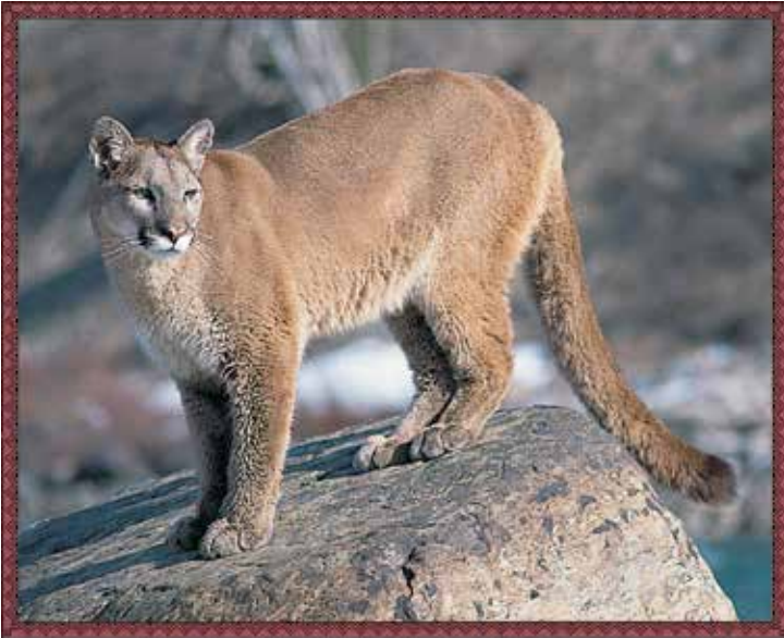
Tom J. Ulrich

C OUGAR have many different names. Some of the more common ones are mountain lion, puma, panther, painter and catamount. They are found mainly in wooded areas. Some are at sea level while others are high in the mountains. At one time their range extended from South America to Southern Canada. At the present time, most cougar are found in the western part of North America. However, there are also numerous reports of cougar being seen in several other areas in the United States and Canada. The color of the cougar is grayish brown or reddish. Adult males weigh between 140 to 160 pounds. The weight of the adult females is between 90 and 110 pounds. The length of the cougar is from 6 to 8 feet, which includes the tail. The role of the cougar in the western states