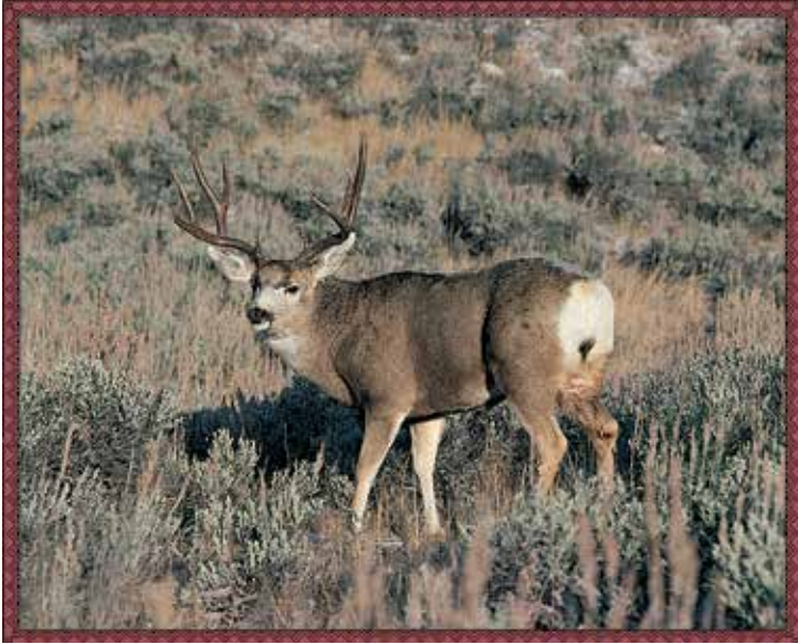
Tom J. Ulrich

W ESTERN North America is the range of the mule and black-tailed deer. They live in a wide variety of prairie, brushland, desert or mountain habitats. The larger mule deer are found inland and have a black tip on the end of their tail. Its relative, the black-tailed deer, with a tail that is almost all black, lives in the coastal area from California to Alaska. Mule deer in the mountains are usually migratory. They spend the summer at high elevations and return to lower elevations at the approach of winter. In prairie and desert habitats, some mule deer may remain in one area all year. Mule deer differ from whitetailed deer in several ways. The whitetail's antlers consist of tines raising from a beam that curves forward. Mule deer have a main beam that fork upward into two tines that may fork again on the larger bucks. Also, the ears of the mule deer are larger and