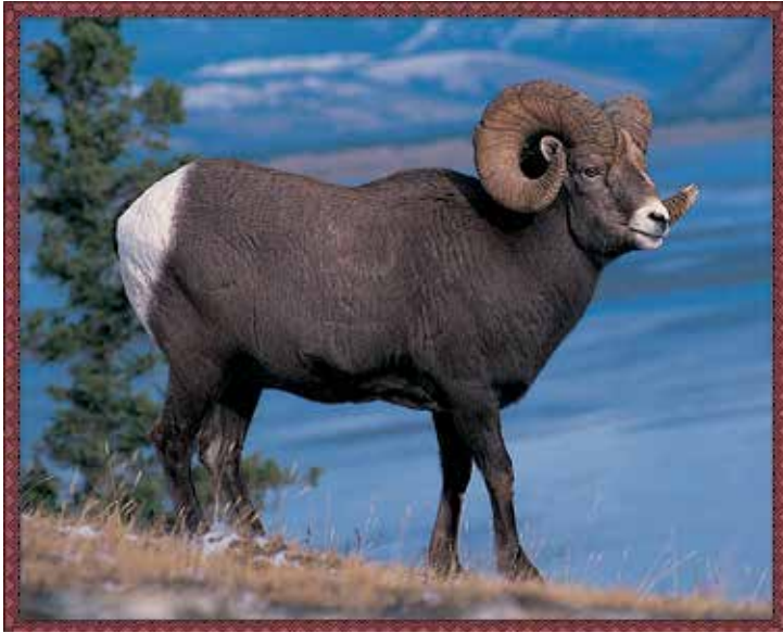
Tom J. Ulrich

T HERE are two subspecies of Bighorn sheep in the United States, Mexico and Canada. They are the Rocky Mountain bighorn and the desert bighorn. Before the coming of the white man, Rocky Mountain bighorn sheep were found over most of the rugged mountainous terrain of western North America. Since that time their number has been greatly reduced, leaving only isolated populations. The decrease of the bighorn population was mainly due to hunters, disease contracted from domestic livestock, and reduction of the food supply through competition with domestic livestock. At the present time, the bighorn population is becoming larger through habitat management and reintroduction of wild bighorn sheep into uninhabited areas. Their diet consists of a wide variety of grasses, shrubs and miscellaneous plants. The type of food eaten depends on the time of year and habitat in which