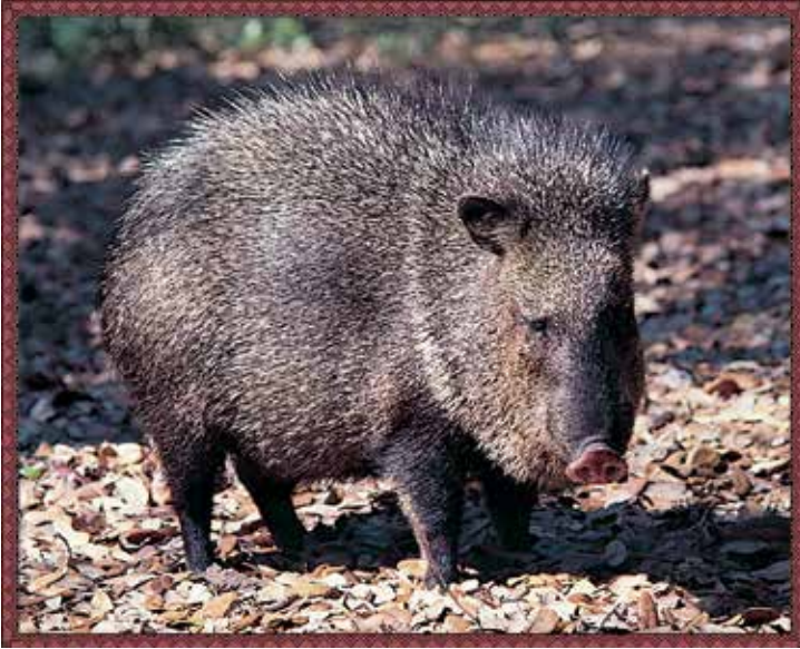
Tom J. Ulrich

T HE collared peccary, sometimes called javelina, are found in the brushy semi-desert and humid forests of southwestern North America and South America. They get their name from the ring or collar of white hair around their neck and the word “percari” which is the Brazilian name for animals that make paths through the woods. The coloration of the adult peccary is referred to as salt and pepper. This is due to the black and white bands of color on each hair. A musk gland that gives off a very strong odor is found on their back about 7 or 8 inches above the tail. The purpose of this gland is unknown. They have good senses of smell and hearing, but poor eyesight. The male and female javelinas are simi-