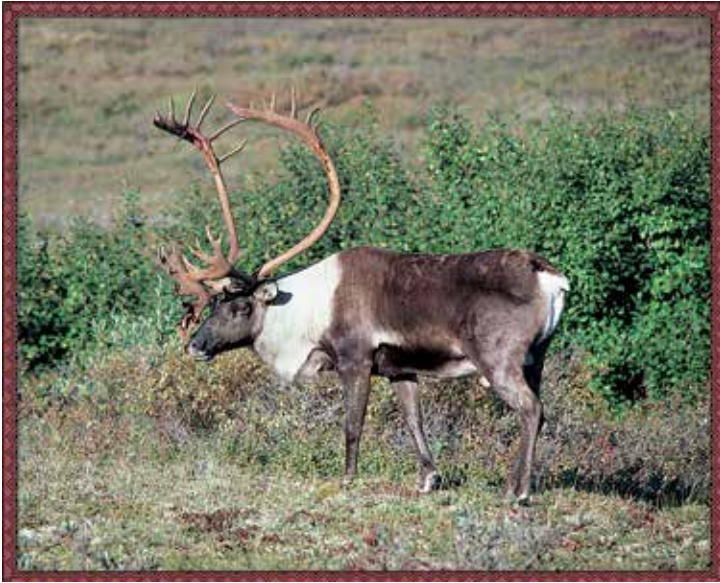
Tom J. Ulrich

T HE history of caribou is similar to that of the bison. They were important to the Indians and Eskimos for food, shelter and clothing and at one time the population numbered in the millions. With the coming of the white man, the population decreased. The effectiveness of the rifle and forest fires were the main reasons for this decrease. The fires burned mature forests that contain the slow growing plants that are important food for caribou. Some of these food plants are lichens, mosses, sedges and various shrubs. Caribou are found in the tundra and coniferous forests of northern North America, Europe and Asia. They are the same species as the reindeer. The word caribou is the Indian name for "pawer". This is due to the caribou's winter feeding habit of pawing a hole in the snow with their broad front feet to