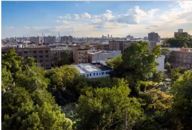
Bronx, NY. Population 1.5 million