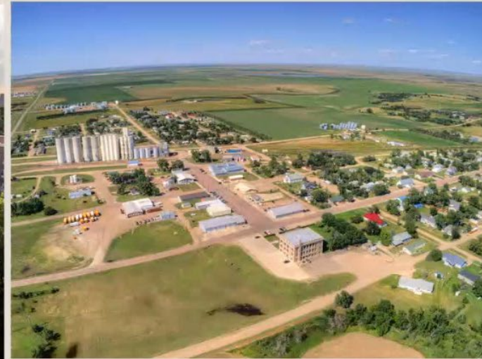
Kennebec, SD. Population 300