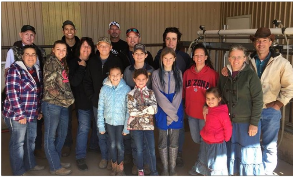
Golden Rule Dairy Field Trip

Dear 4-Her's, Families, Volunteers, and Leaders,