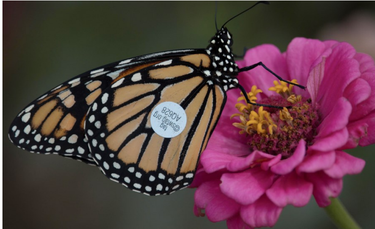
Tagged monarch butterfly.

Monarch butterflies have been a subject of increasing concern as their numbers have decreased greatly at overwintering sites in Mexico and California. Reasons for the decline in monarch butterflies vary from place to place but include the loss of wild milkweed populations (larval food plants), pesticide use in agriculture and urban areas, climate change, and logging and development of overwintering sites. Several local efforts are under way to increase the availability of milkweeds and to “tag” migrating adults as they pass through Arizona. These citizen science efforts monitor preferred milkweed species used for food, migration routes used, and ultimately which monarchs are successfully arriving at overwintering sites.