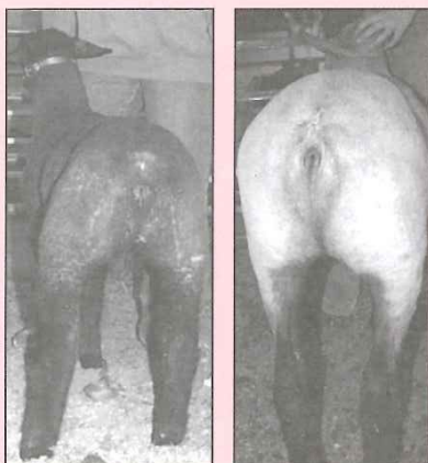
92 Days Pre-Fair