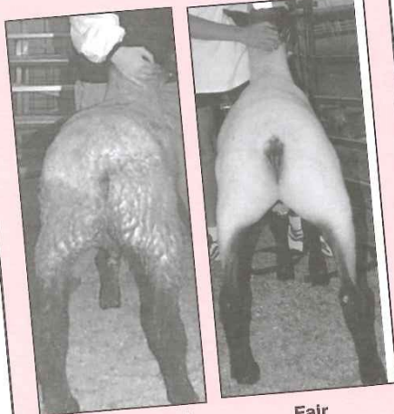
92 Days Pre-Fair