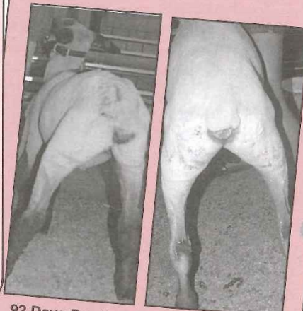
92 Days Pre-Fair