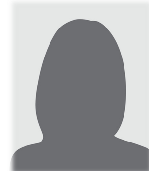
RACHEL SKOUSEN Rabbit/Cavy/Dog Youth Representative