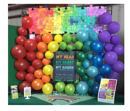
Maricopa County Fair