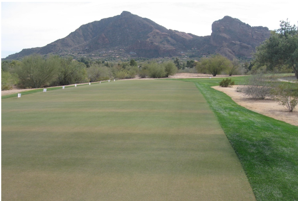
Comparisons of colorants on a golf green near Camelback Mountain.