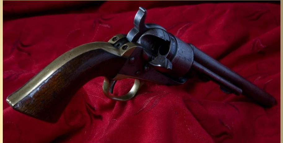
Gallatin Historical Society Pioneer Museum Collection, Bozeman, MT. Will Abbot Photo.

Left Top: Colt 1860 Army Richards Conversion (Note flat hammer, rear sight, and ejector housing)