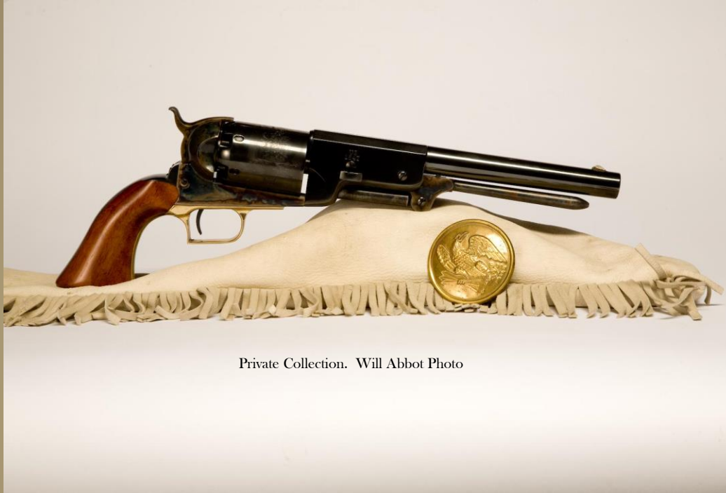
Private Collection.