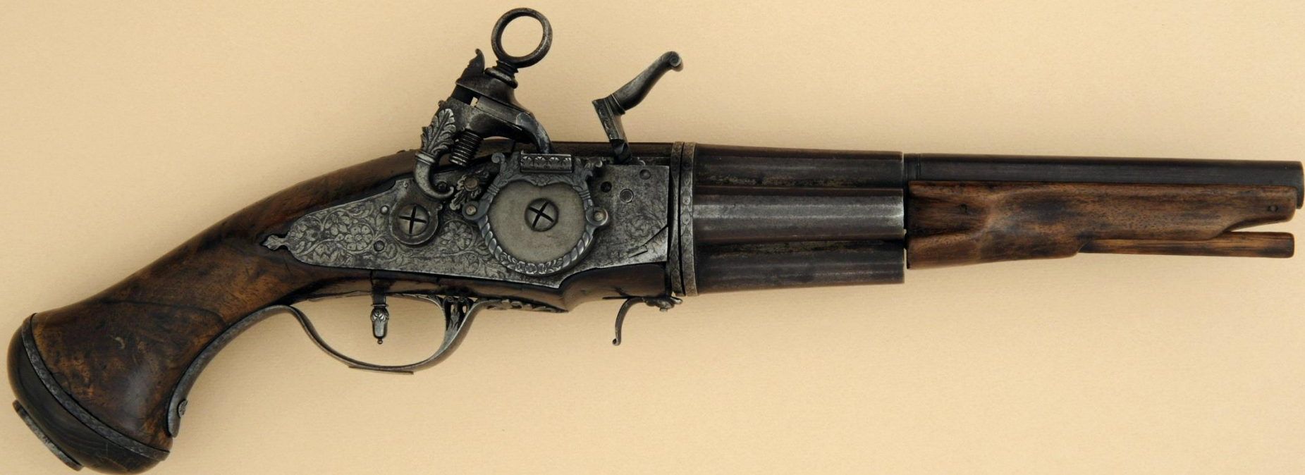
Smoothbore four shot flintlock revolver in .52 caliber. Unknown maker in Bresica, Italy around 1690 and was converted to percussion in the 1820s or 1830s. Courtesy of the Buffalo Bill Historical Center, Cody, Wyoming; accession number 1986.9.1