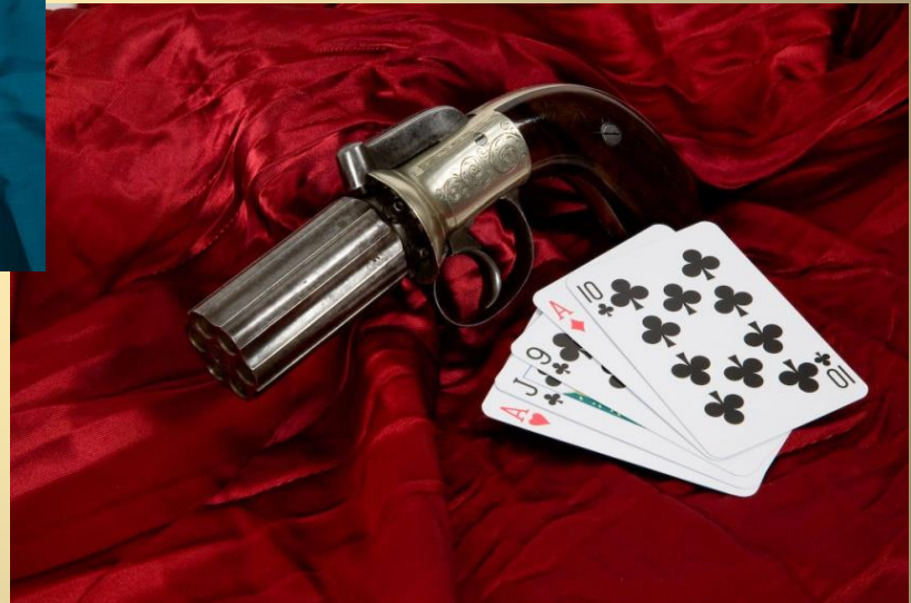
Museum of the Rockies Collection, Bozeman, Montana . Will Abbot Photo