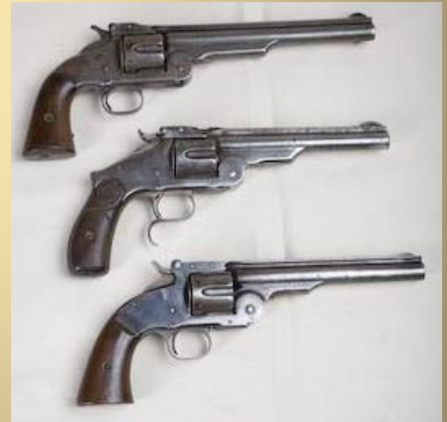
From the D. Cappa Family Collection on display at the Frontier Montana Museum, Powell County Museum & Arts Foundation, Inc., Deer Lodge, Montana.