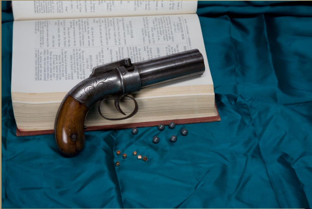
Gallatin Historical Society Pioneer Museum Collection, Bozeman, Montana.

Allen and Thurber Pepperbox Pistol; Worcester, MA