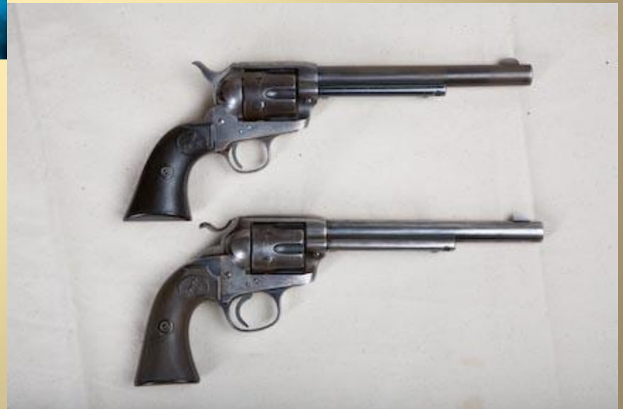
From the D. Cappa Family Collection on display at the Frontier Montana Museum Powell County Museum & Arts Foundation, Inc., Deer Lodge, Montana.