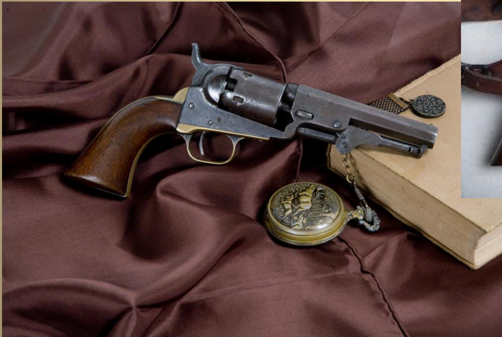
Gallatin Historical Society Pioneer Museum, Bozeman, Montana.