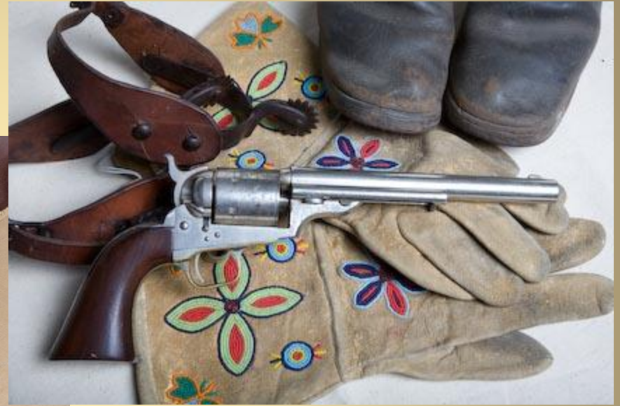
From the D. Cappa Family on display at the Frontier Montana Museum, Powell County Museum & Arts Foundation, Inc., Deer Lodge, Montana.