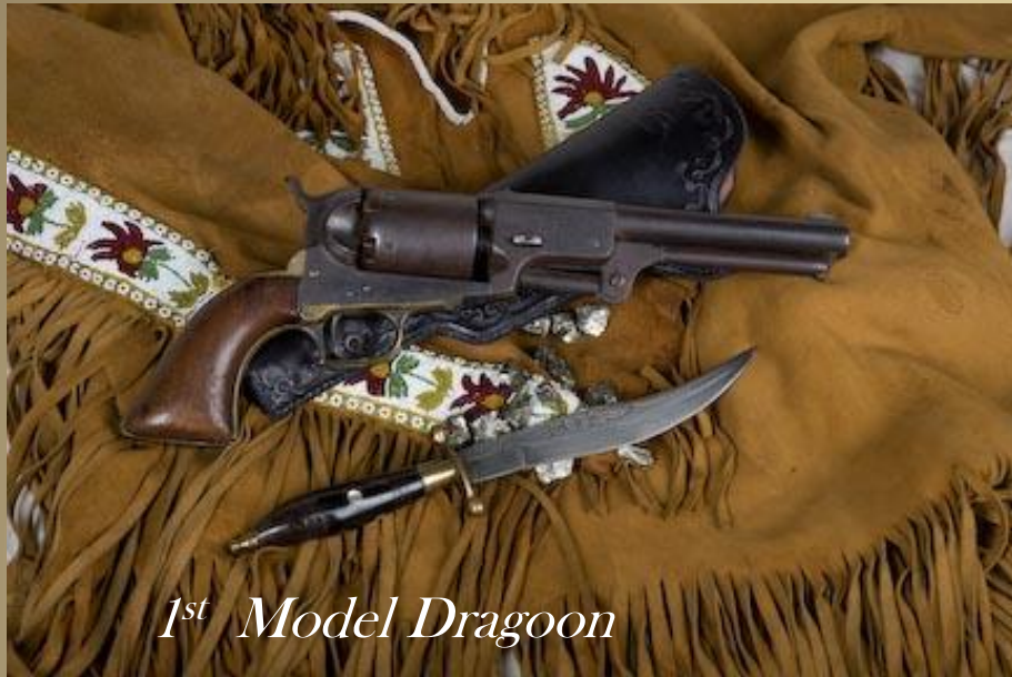
1 st Model Dragoon