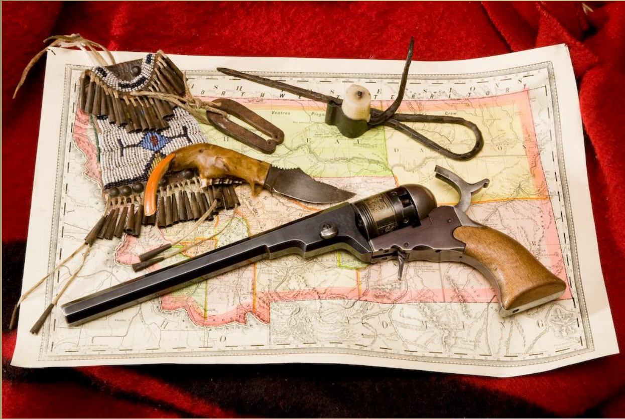
Private Collection.