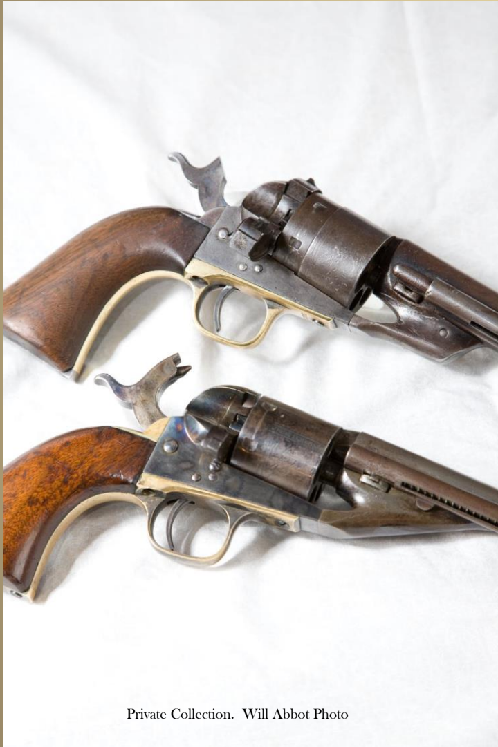
Private Collection.