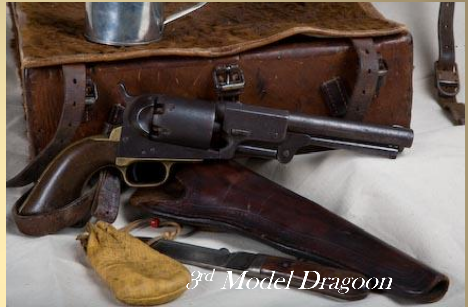
3 d Model Dragoon

From the D. Cappa Family Collection on display at the Frontier Montana Museum, Powell County Museum & Arts Foundation, Inc., Deer Lodge, Montana.