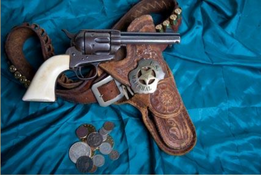
From the D. Cappa Family Collection on display at the Frontier Montana Museum Powell County Museum & Arts Foundation, Inc., Deer Lodge, Montana.