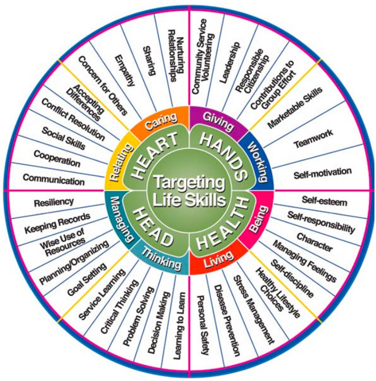
Figure 2: The Targeting Life Skills Model is an excellent overview of the life skills 4-H professionals and volunteers aim to teach young people. (Hendricks, 1996).