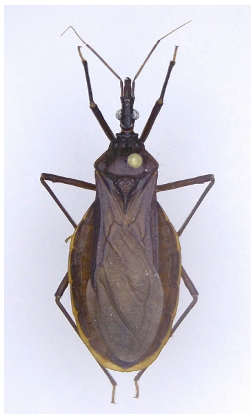
Figure 4. Adult T. recurva . The University of Arizona Insect Collection as host for specimens.