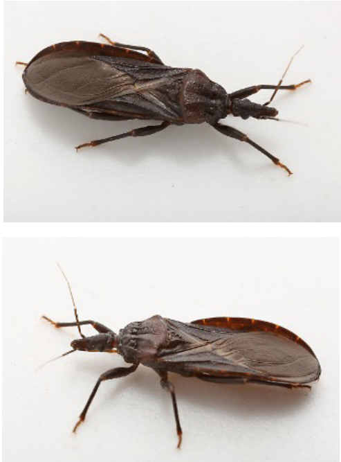
Figure 3. Adult western bloodsucking kissing bug, T. protracta . Collected in Flagstaff, Coconino County, Arizona and the Museum of Northern Arizona as host for specimens.

As adults, T. rubida is larger than T. protracta , and is easily distinguished by the reddish or brownish-red lateral markings on the abdomen seen just outside the folded wings. T. recurva is the largest among the three common species, with pronotum uniformly dark colored and strongly up-curved edges of its wide abdomen.