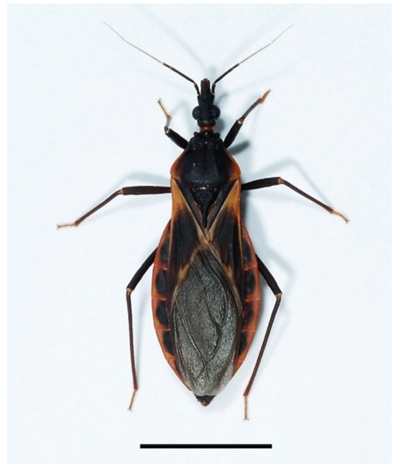
Figure 2. Adult female T. rubida , the most abundant species of kissing bugs in Arizona. Scale bar = 1 cm.