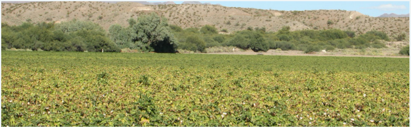
Areas of field with higher disease severity