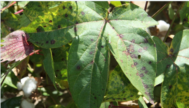
Shot-hole appearance after center of lesion is detached