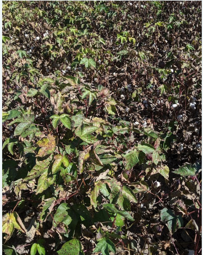
Severely infected cotton in the late season