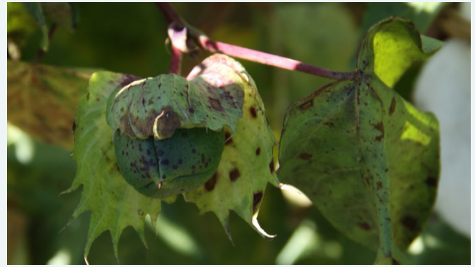
Necrotic lesions on bolls and bracts

INTRODUCTION: Alternaria leaf spot of cotton is also known as Alternaria leaf blight. The disease was first identified in cotton in the US in 1918 and is now distributed worldwide. Alternaria leaf spot has been considered a minor disease in the cotton growing areas of Arizona. The disease is frequently associated with senescing tissue of cotton under physiological stress (heavy boll load) or nutritional stress (potassium deficiency) late in the growing season. On rare occasion it can also affect seedlings. In recent years, several disease outbreaks that led to severe defoliation in late-season cotton were reported from Graham County. The disease can severely affect susceptible Pima cotton varieties and also attack upland cotton varieties. Susceptible varieties have had nearly 100% of leaves infected in years when weather conditions are conducive for disease infection and development. The impact on yield in Arizona was estimated to be 10% to 15% in highly susceptible cotton varieties.