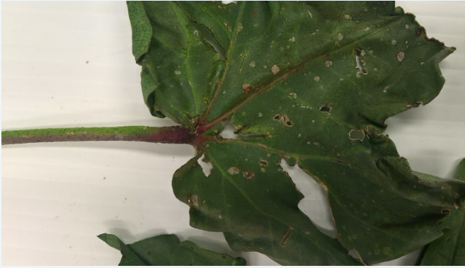
Shot-hole appearance after center of lesion is detached