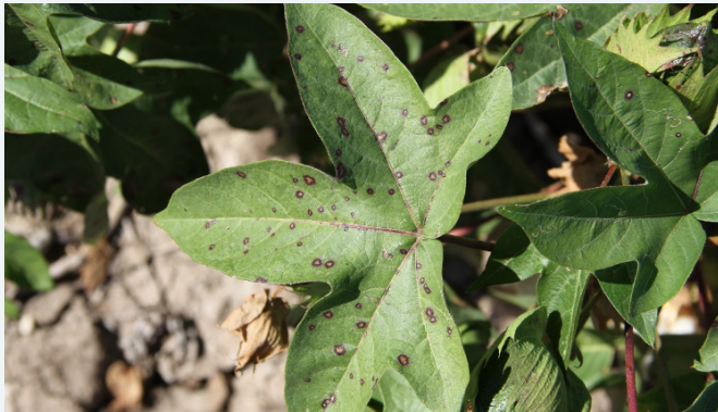
Necrotic lesions surrounded by purple halo margin