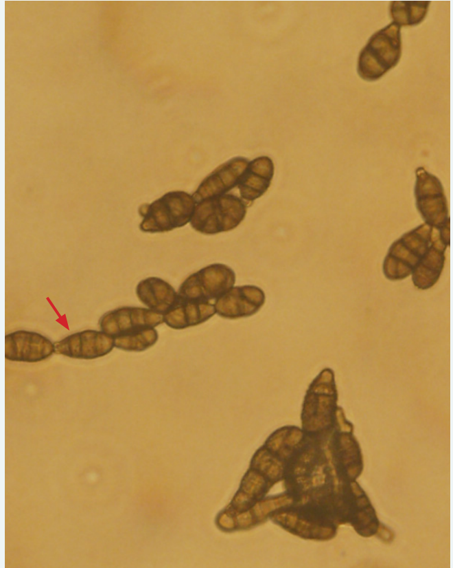
Asexual spores (conidia): thick-walled, multicellular, and pigmented; conidia chain (arrow)