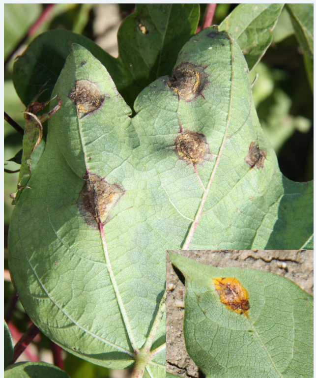
Rust pustules on lower leaf surface (Yellow orange)