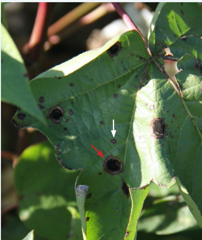
Lesions of southwest cotton rust (red arrow) and Alternaria leaf spot (white arrow)