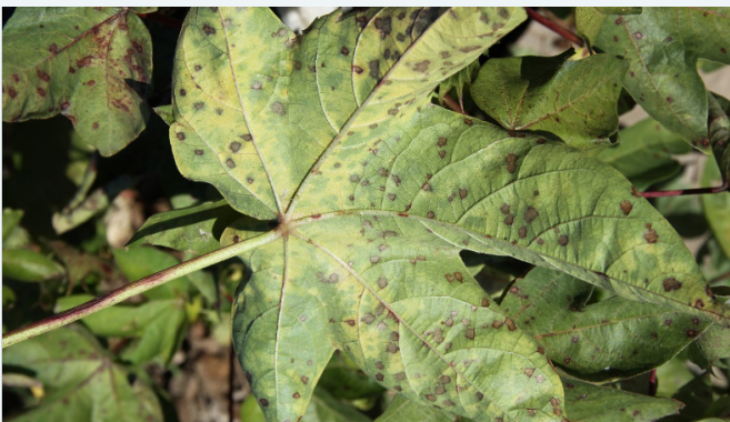
Necrotic lesions on the lower leaf surface