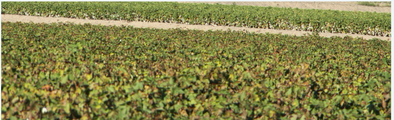
Fields planted with susceptible and tolerant hybrids with obvious differences in the extent of blighted leaf area