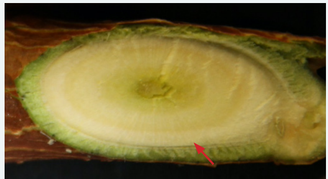
Vascular tissues of healthy plant (white arrow) vs Light to dark brown streak (flecking) of plant infected with Verticillium wilt (red arrow)