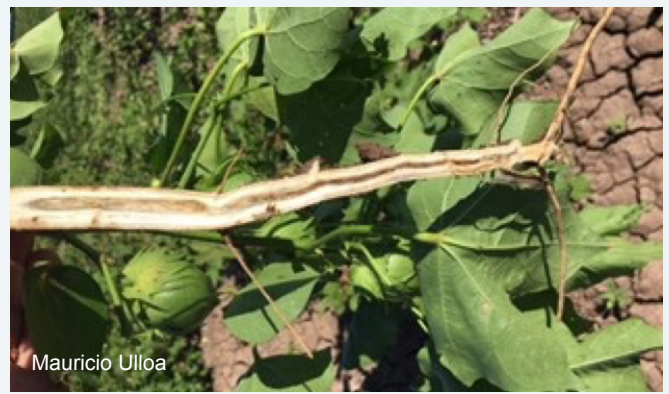
Continuous staining in taproot of late season upland cotton

cause visible symptoms and economic damage. In contrast, the newly emerged FOV4 is more aggressive and virulent on many susceptible Pima cultivars and Upland cultivars grown in neutral to alkaline soil in the absence of root-knot nematode.