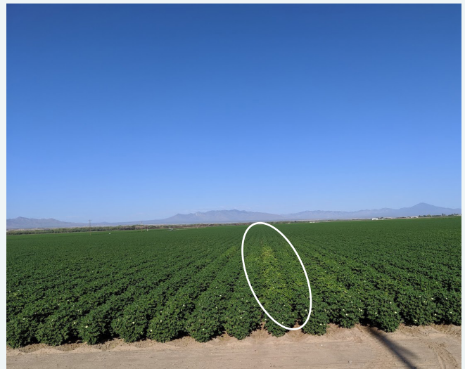
Cotton fields infested with Fusarium Wilt