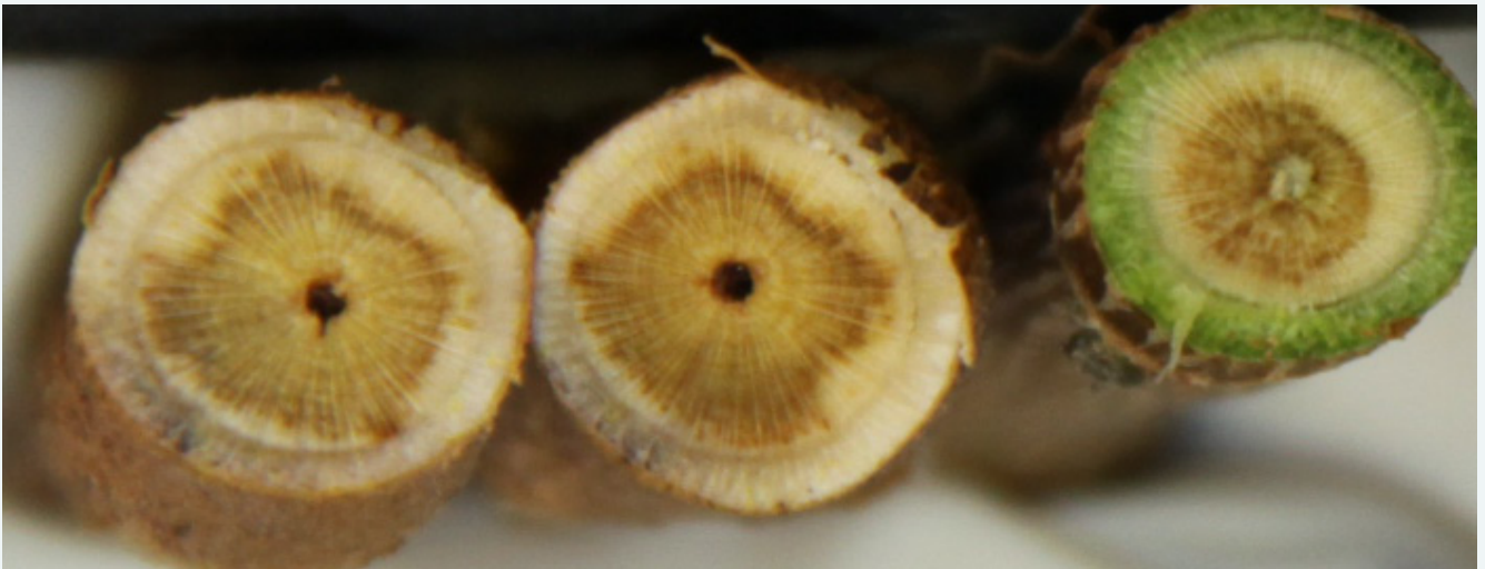
Brown staining of vascular tissues of plants infected with Fusarium wilt