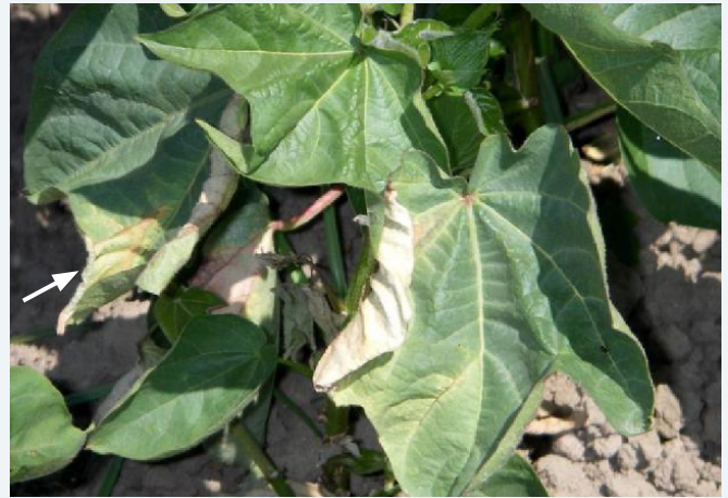
Interveinal and marginal leaf chlorosis and necrosis