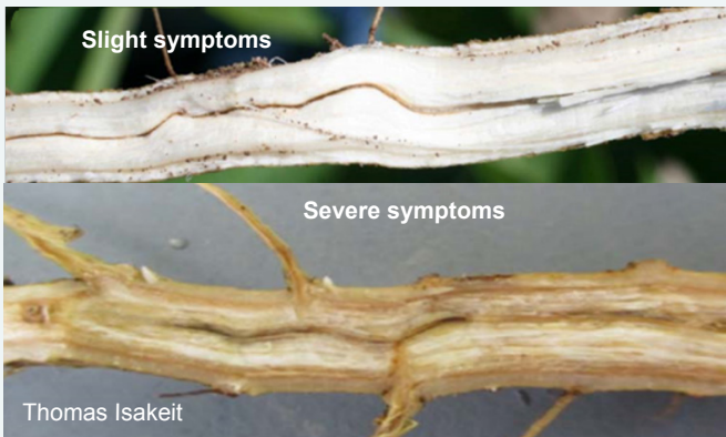
Pencil-line pith staining of taproots