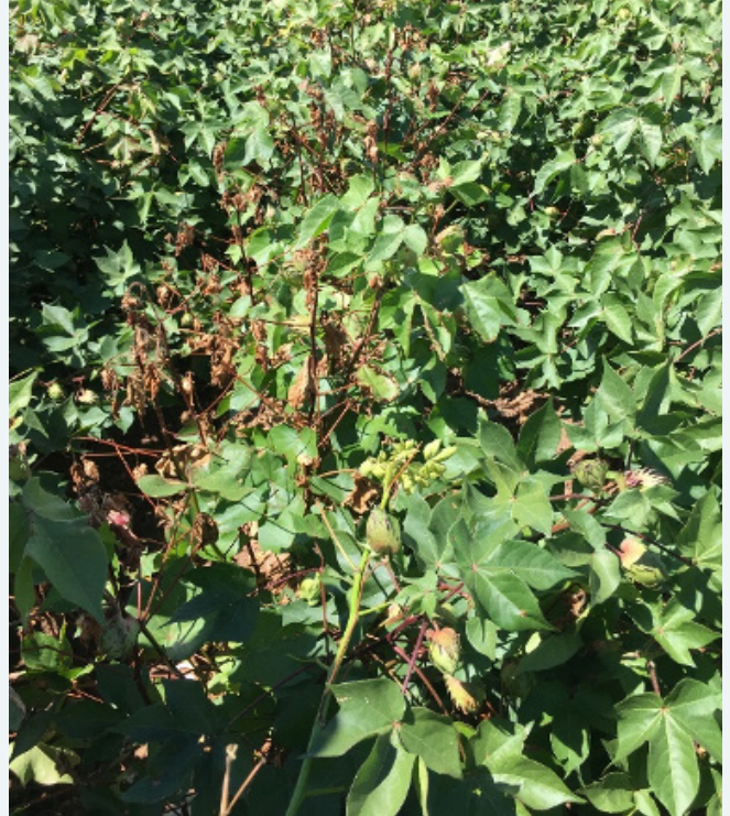
Yellowing, wilting, and dying of FOV-infected plants