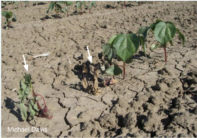
Seedlings killed by FOV4