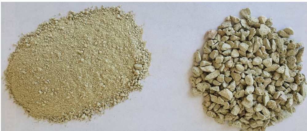
Figure 1: Zeolite (clinoptilolite) in different particle sizes.

The high porosity of zeolite structure helps improve soil structure and increase aeration without clogging soil pores. Because of their porous nature zeolites can hold more than their weight in water, and in soil can act as a reservoir providing a prolonged water supply. Zeolites can improve water infiltration into soil, and speed re-wetting and lateral spread of irrigation water in the root zone (Nahkli et al., 2017).