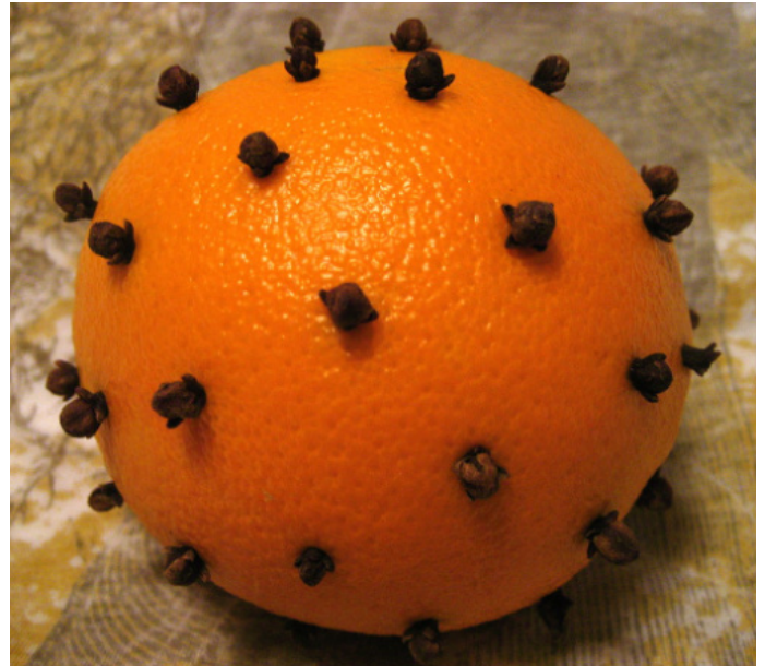
Figure 20. Orange pomander.